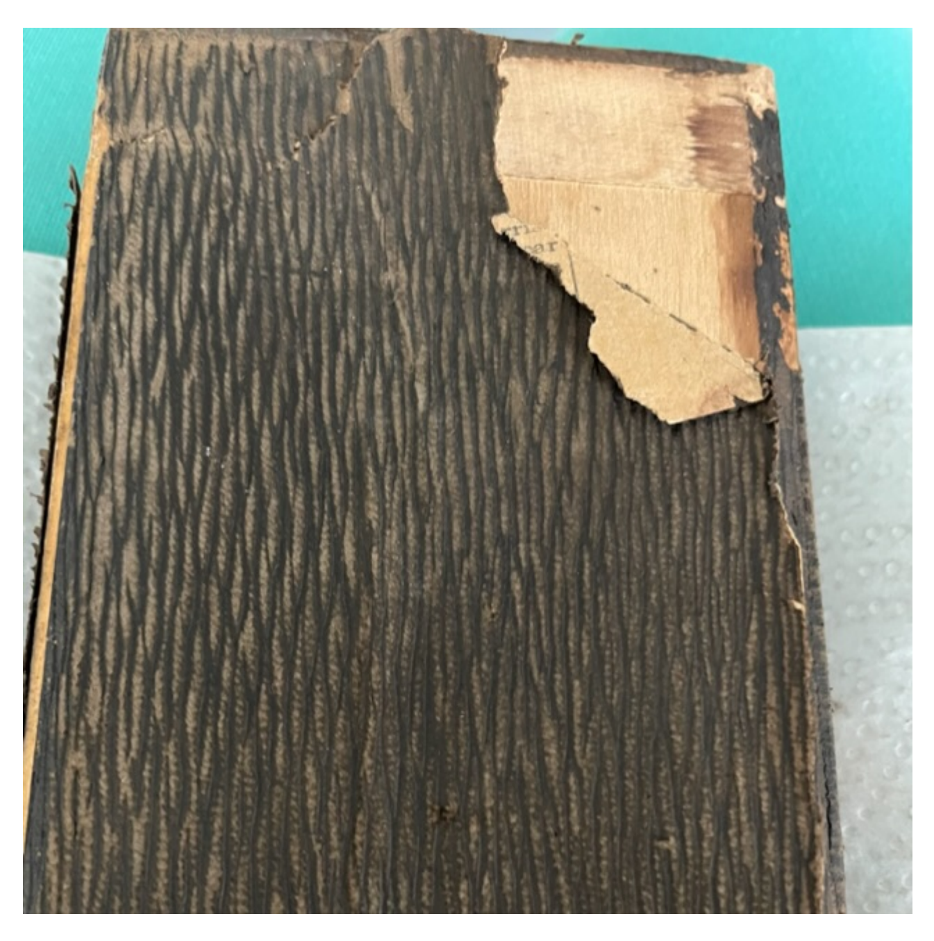
2) C60C8163-0F8D-4F18-A047-D0E16BC8073E.jpeg, downloaded 348 times