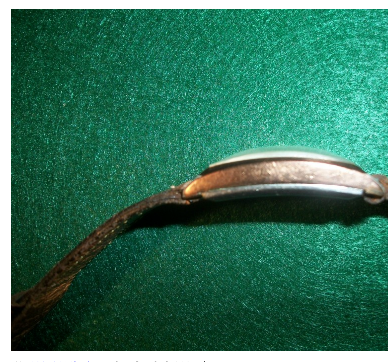
4) 100_0111b.jpg, downloaded 918 times