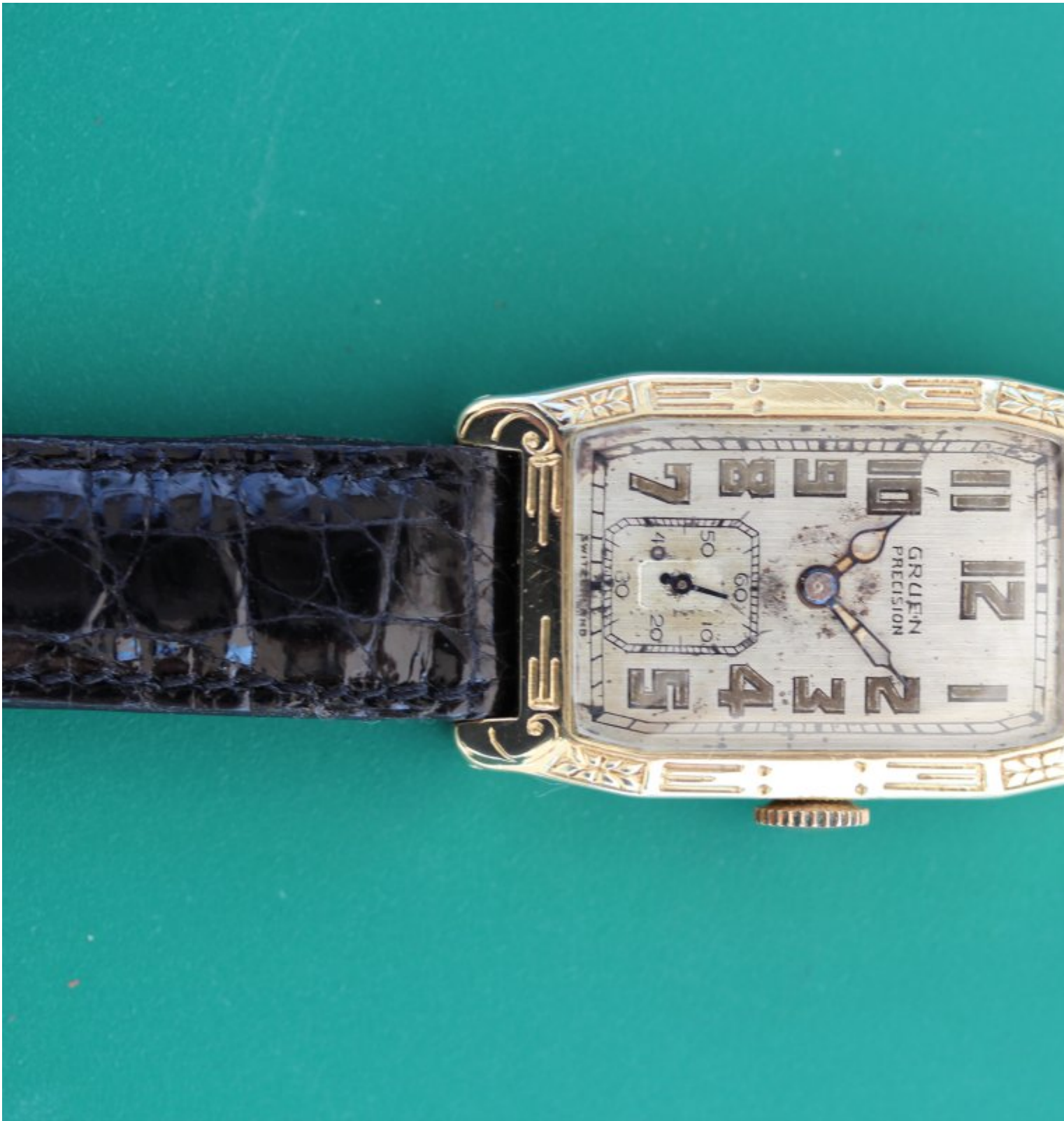
2) Img_0361b.jpg , downloaded 726 times