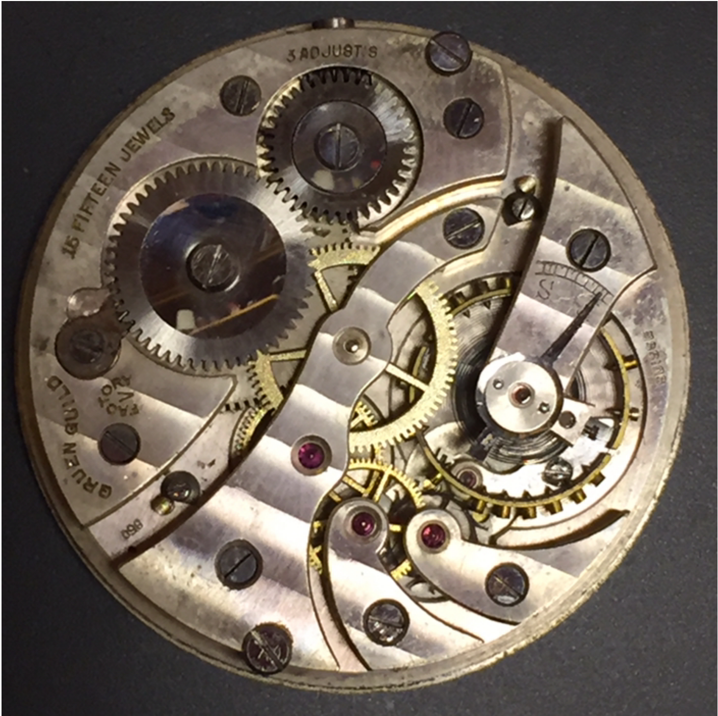
2) 56F6014C-1ED1-4CB6-8BA3-4DAABA96F075.jpeg , downloaded 960 times