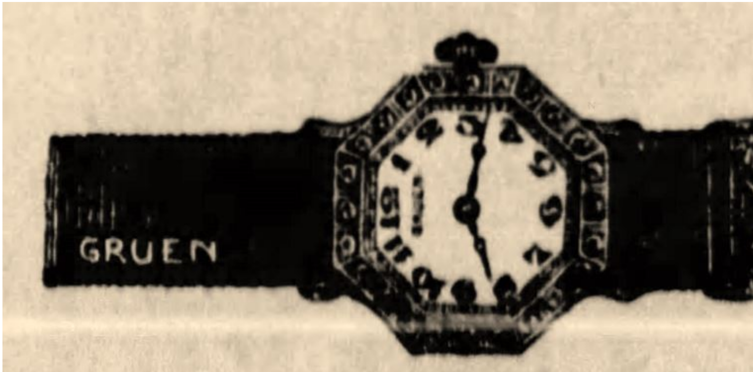
4) Octagon 1921.JPG , downloaded 2776 times