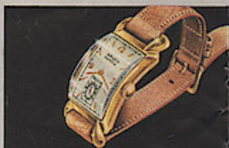
Curvex Captain, $59.50

See the wasted space in an ordinary watch. Flat movement in curved case has smaller parts. It's a curved case, not a curved watch!