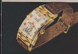
Curvex Constellation, $125