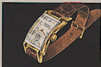
Curvex "One Hundred," $100