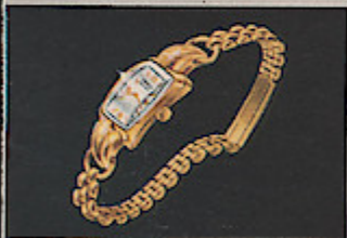
Curvex Petite, $67.50