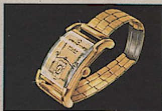
Curvex Camargo, $71.50