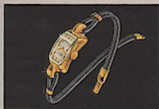
Curvex Peeres, $49.75