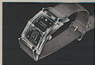
Curvex Director, diamond dial, $250