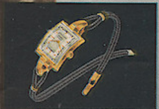
Curvex Riviera, $100