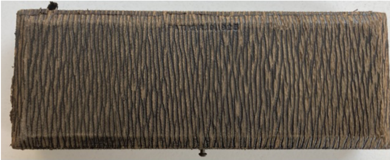
3) 6C8A30D3-1287-4589-8B99-A4A7D0392D9B.jpeg , downloaded 1288 times