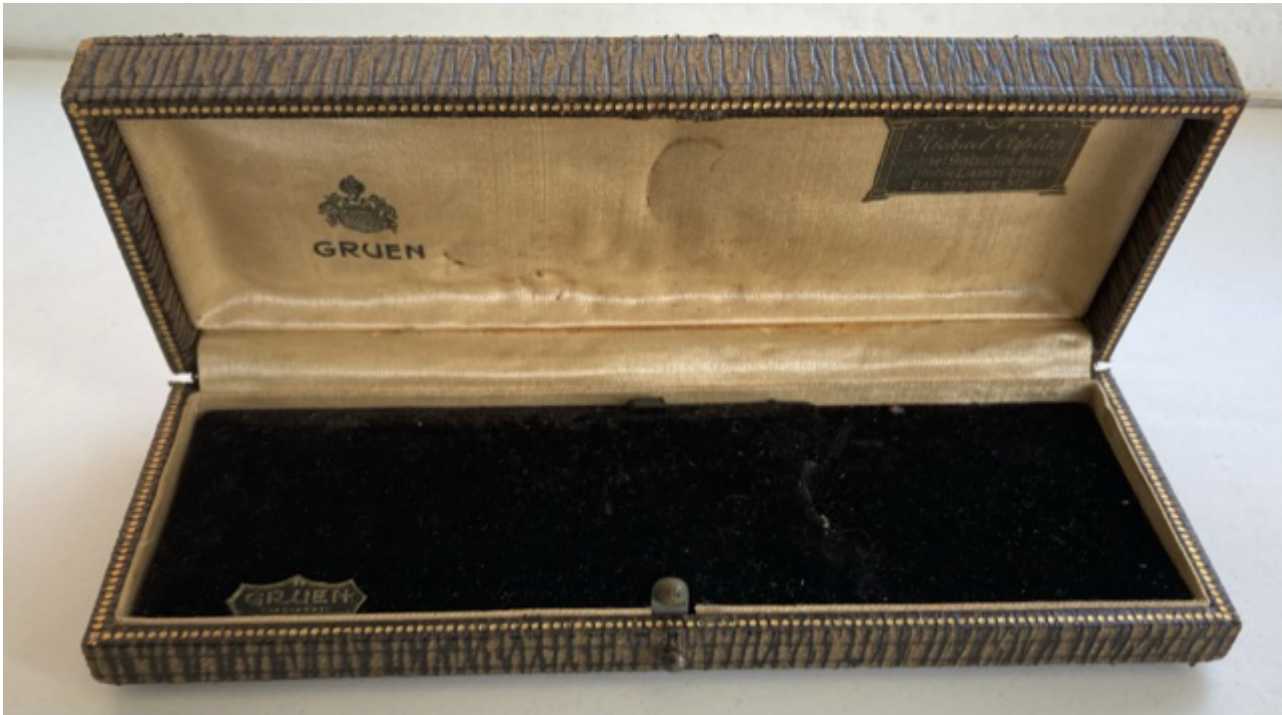
4) 4817D002-74CC-406D-9BD8-AD6AF010CCB2.jpeg , downloaded 1317 times