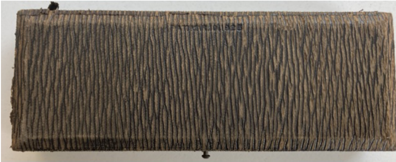
3) 6C8A30D3-1287-4589-8B99-A4A7D0392D9B.jpeg , downloaded 996 times