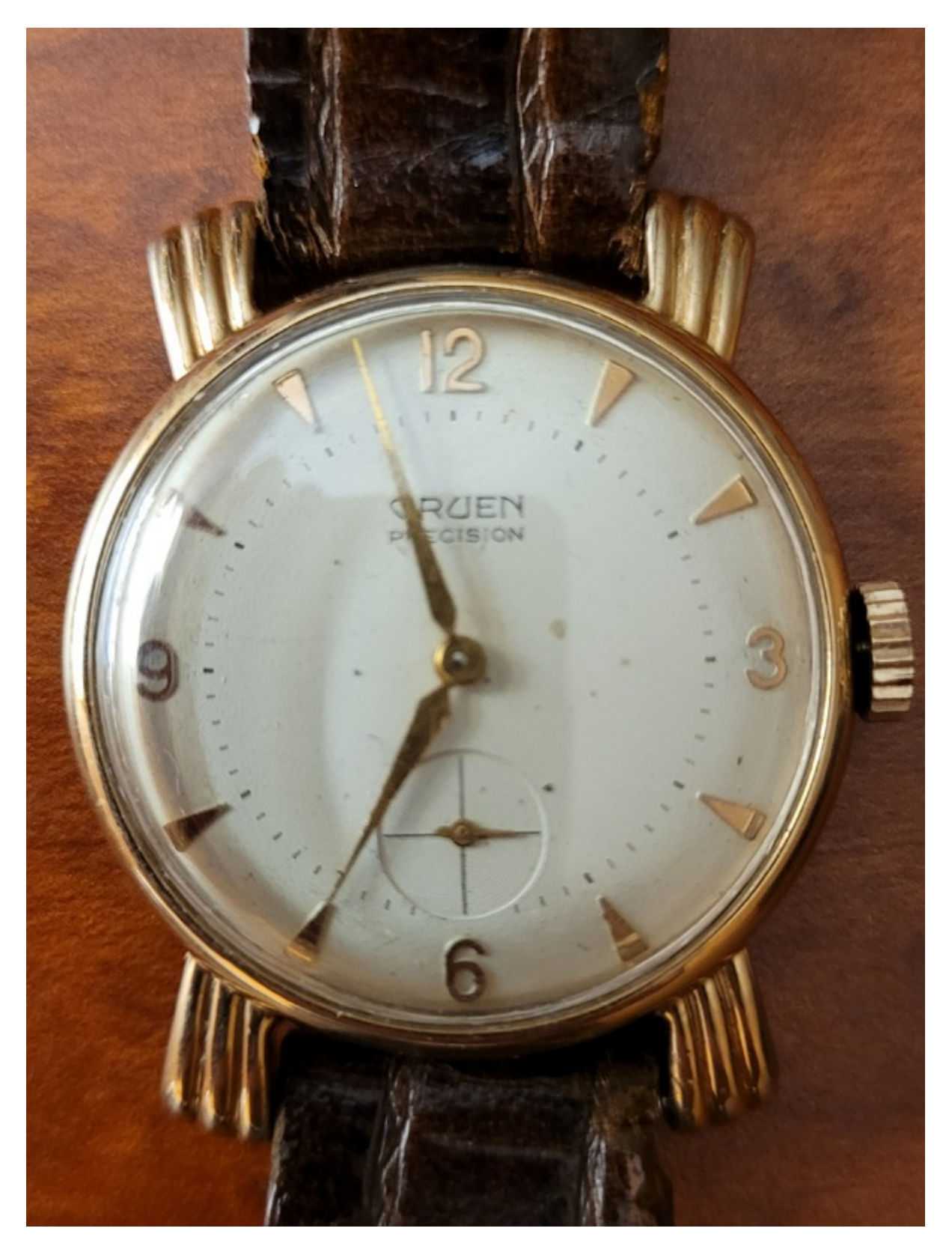
5) 2021 Reg (5).jpg, downloaded 2180 times