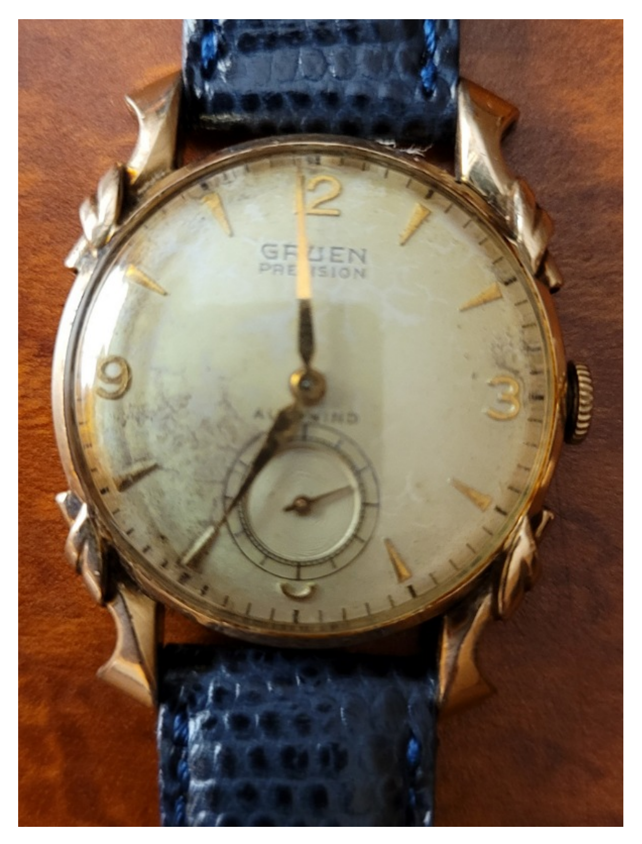
4) 2021 Reg (4).jpg, downloaded 2098 times