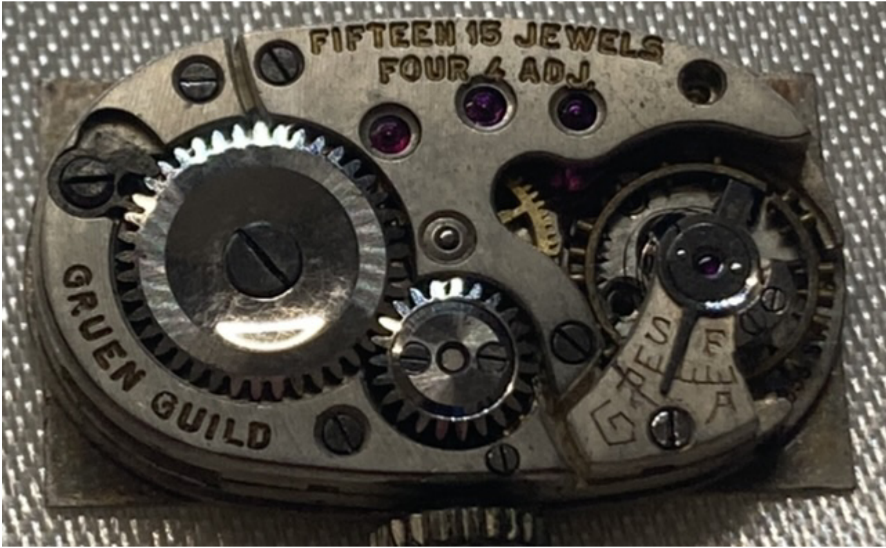
5) CEC9D4DD-027F-405F-9BCB-B97E1A73FFF2.jpeg , downloaded 1643 times