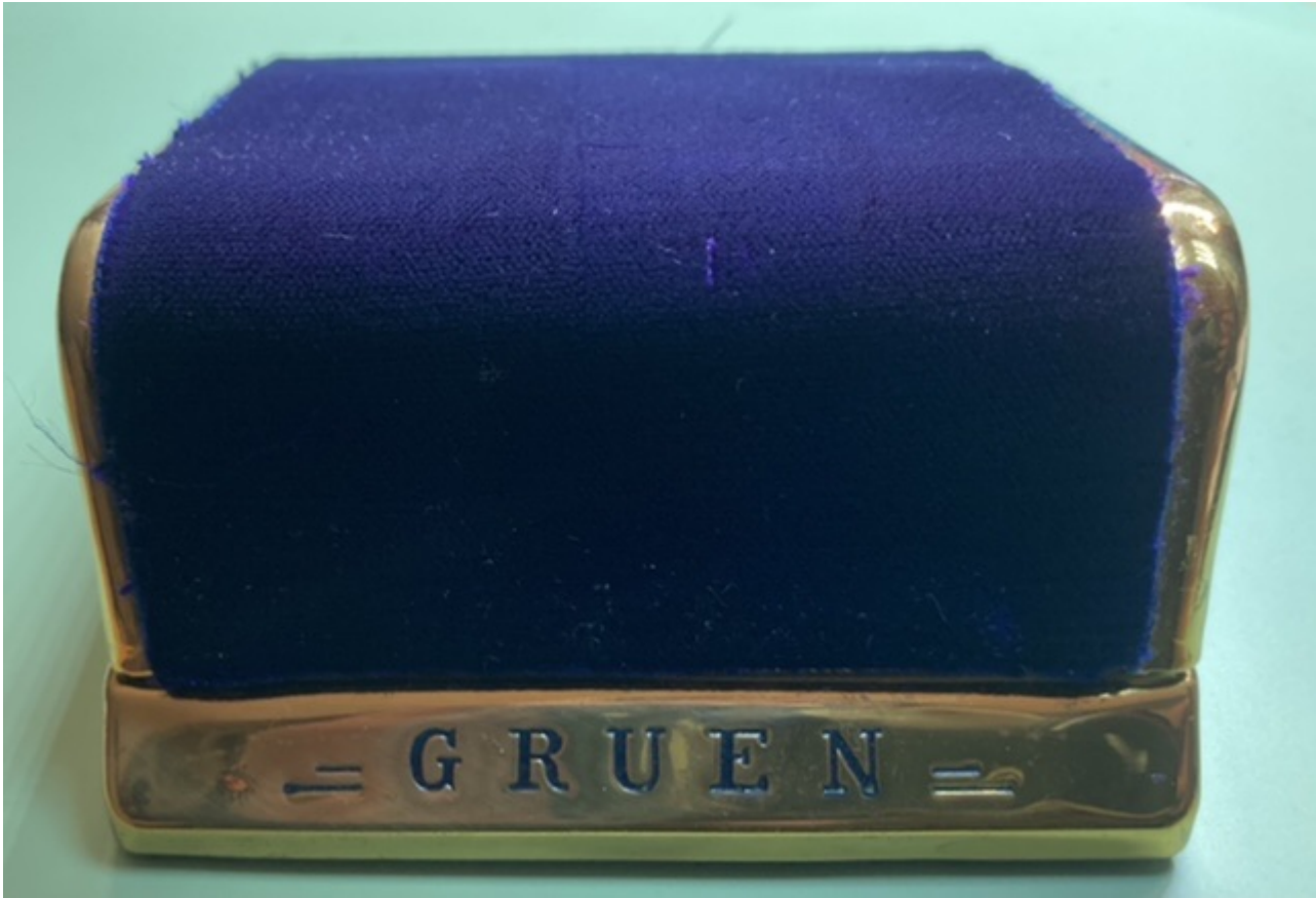
2) CC04B3C2-D3A9-4951-A8D4-257B170B3731.jpeg , downloaded 2646 times