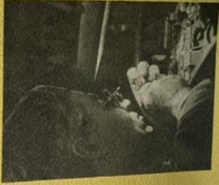
Gruen is the Official Watch of TWA - Trans World Airline

YOU ARE NOW the proud possessor of one of the world's finest watches. Like every Gruen timepiece, it is a modern example of exquisite design, beauty and workmanship. Hands skillfully trained in the craft of fine watchmaking have fashioned the wheels, springs and jewels into the miracle of Precision that is your Gruen. May we wish you many "happy hours" while you wear it through the years.