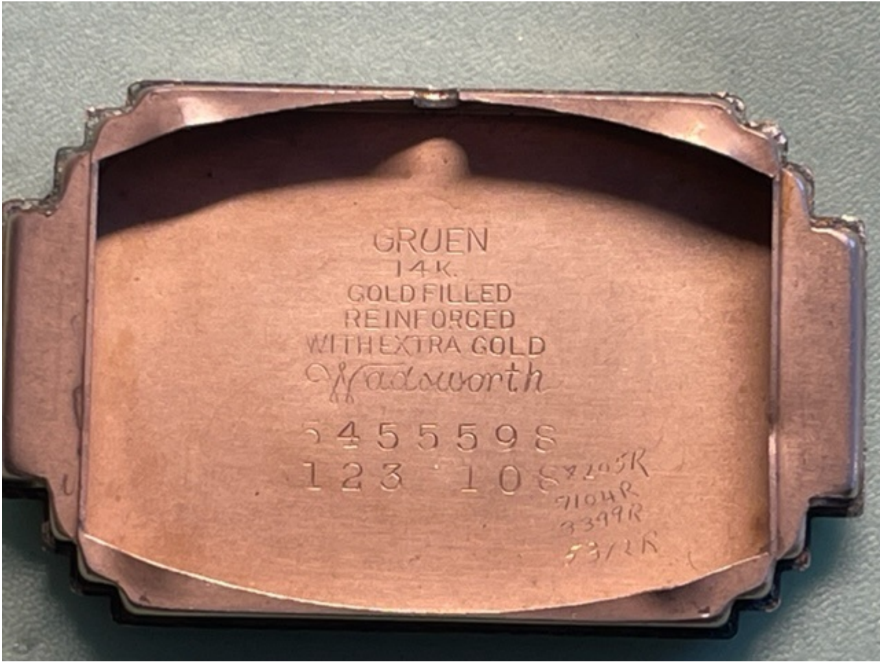
3) G Ann (2).jpg , downloaded 1455 times