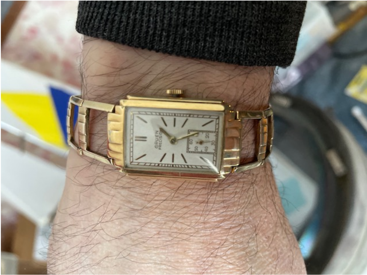
4) annapolis.JPG , downloaded 2784 times