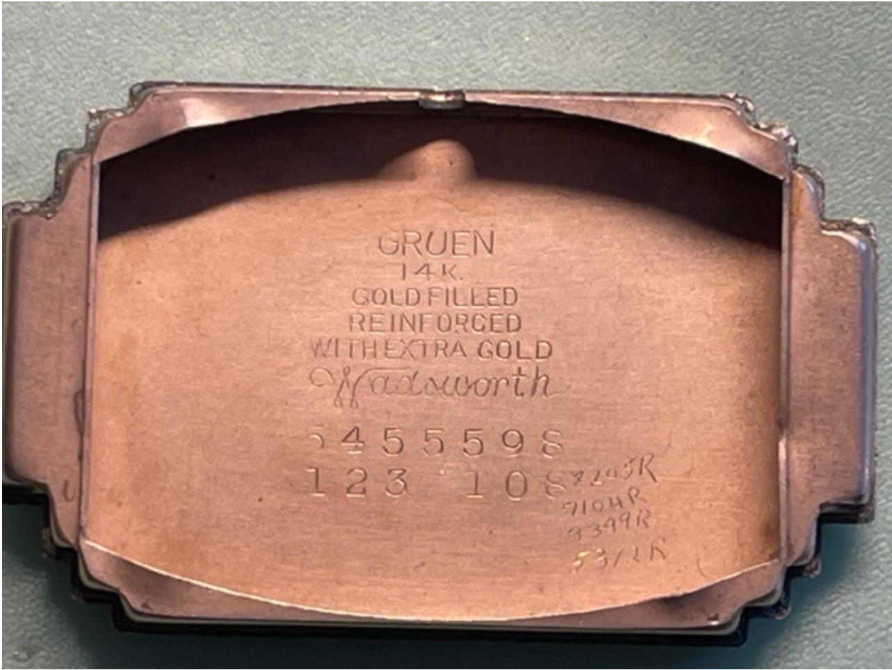
3) G Ann (2).jpg , downloaded 2786 times