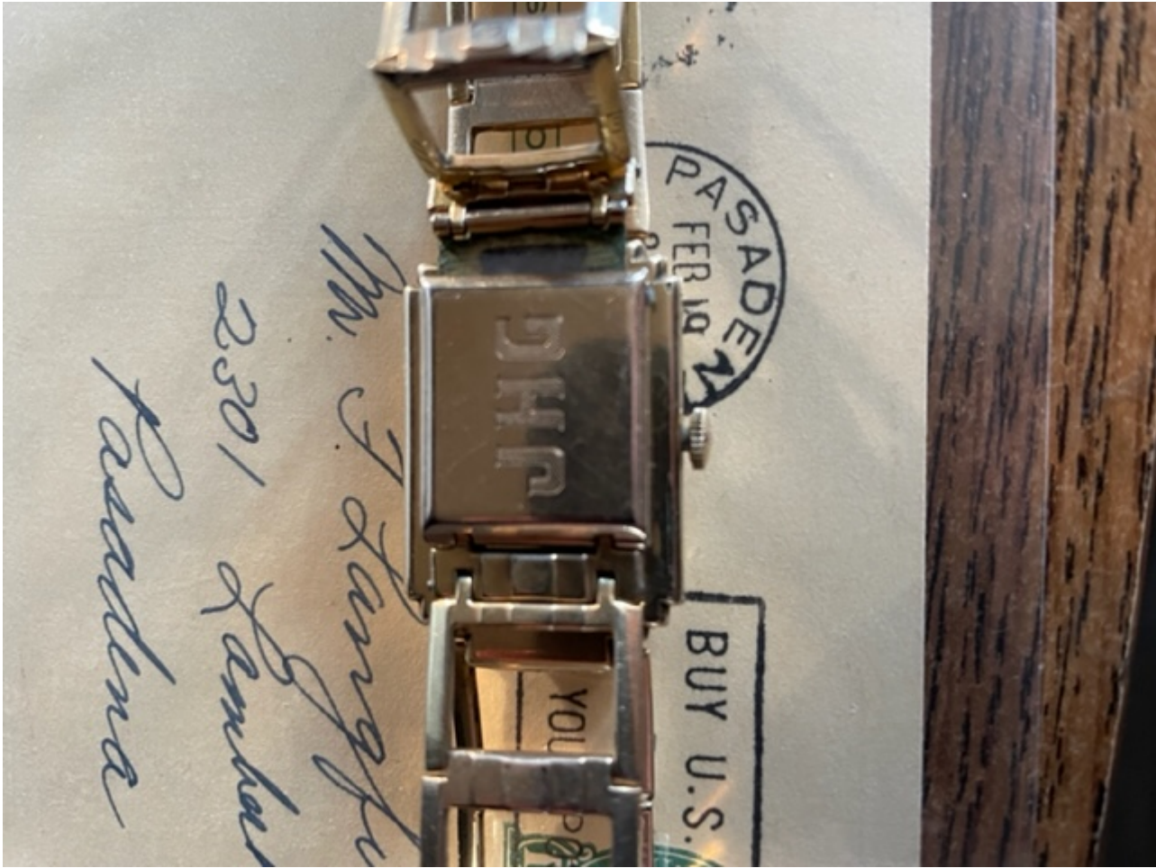
5) Wadsworth band (5).jpg , downloaded 1148 times