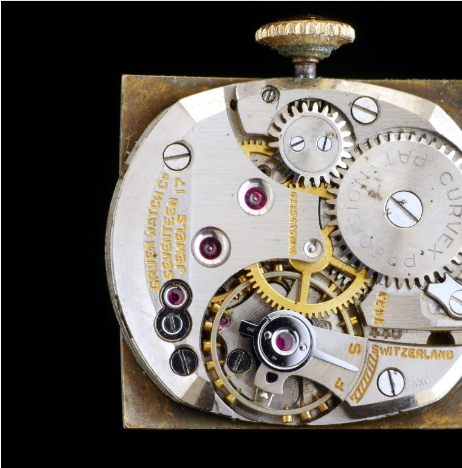
5) Gruen-Curvex_440-584_14K_08_1366.jpg , downloaded 1319 times