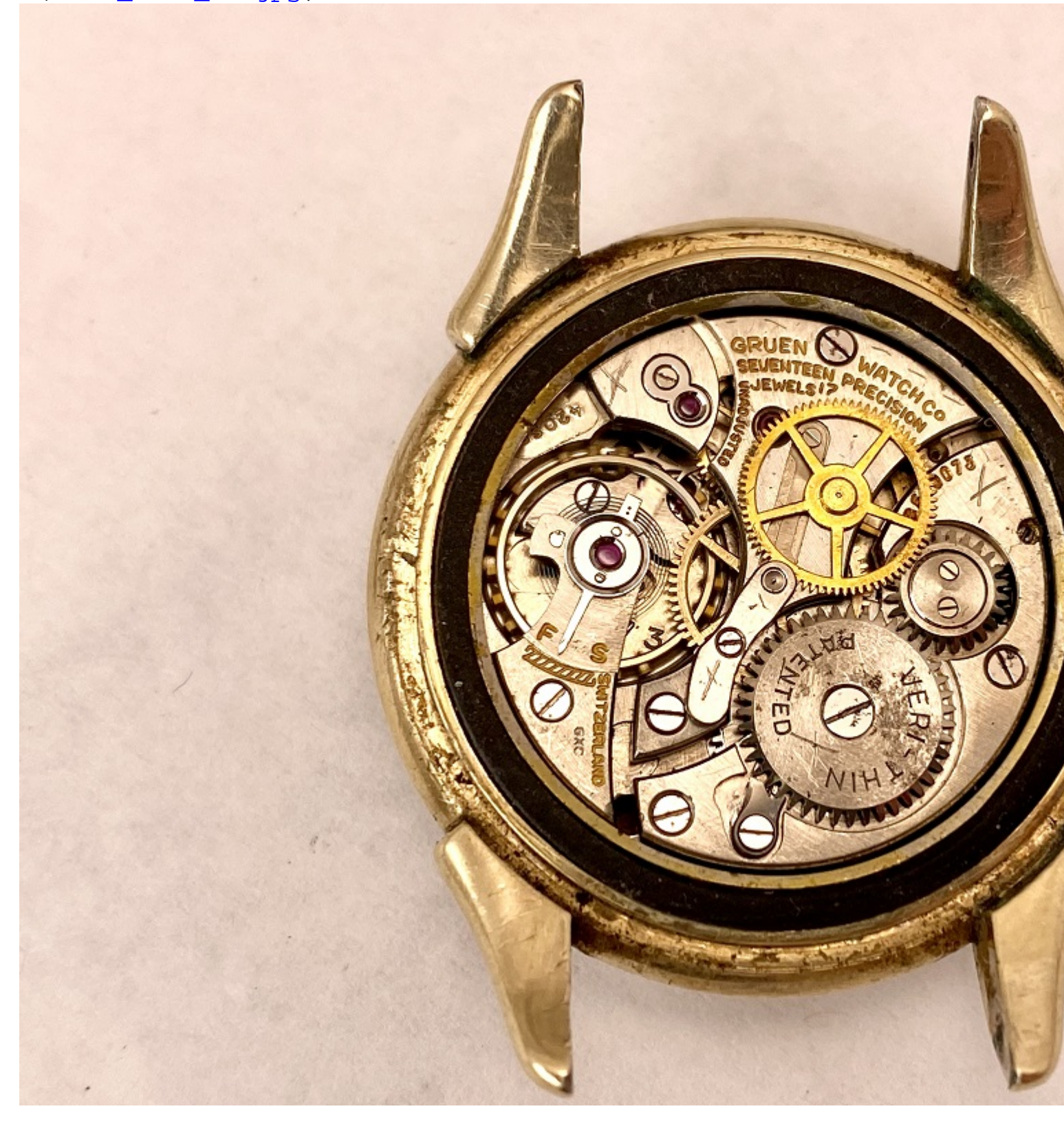
3) IMG_1138_sm.jpg, downloaded 1187 times

2) IMG_1137_sm.jpg, downloaded 1171 times