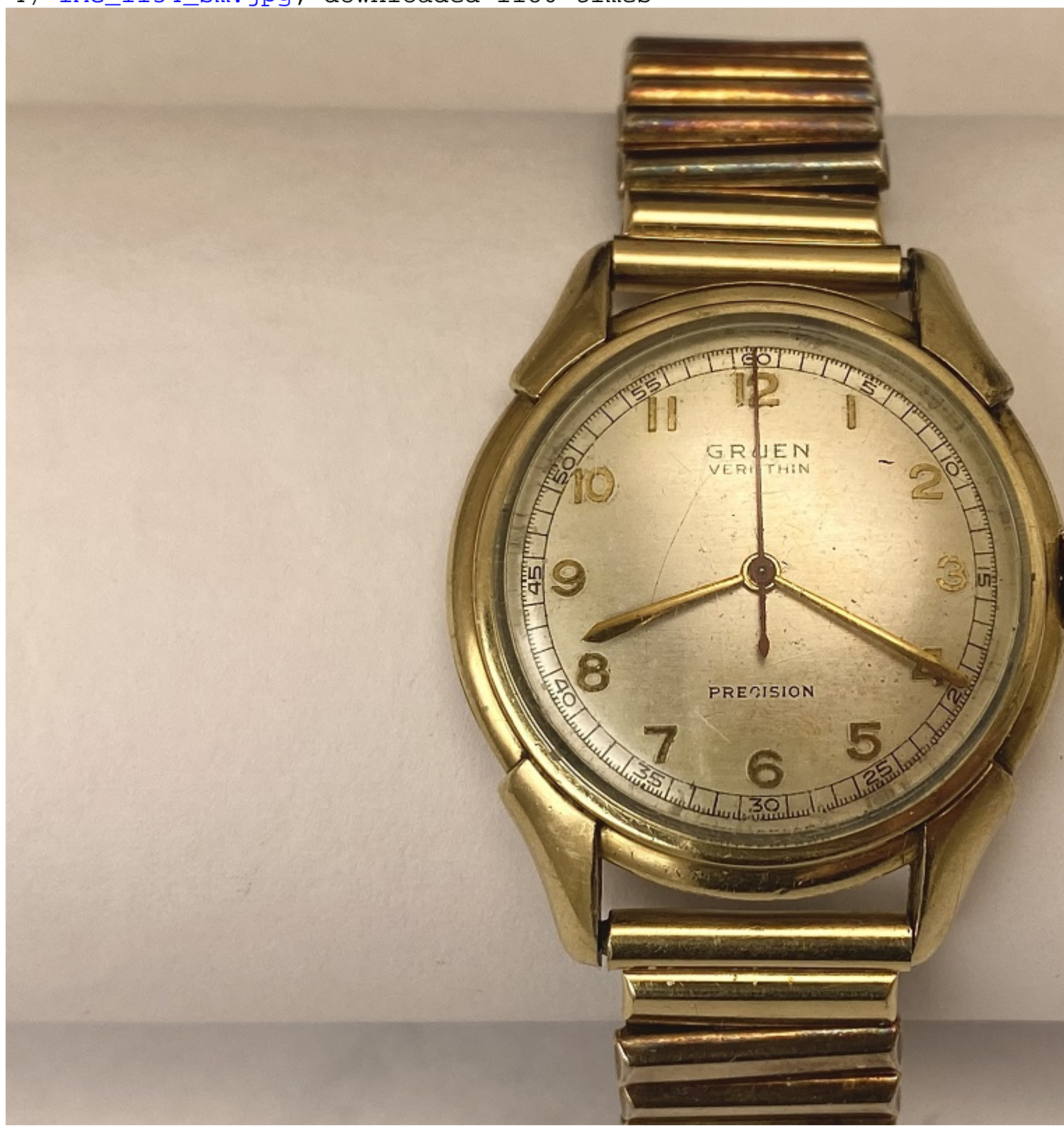
5) IMG_1135_sm.jpg, downloaded 1183 times

4) IMG_1134_sm.jpg, downloaded 1180 times