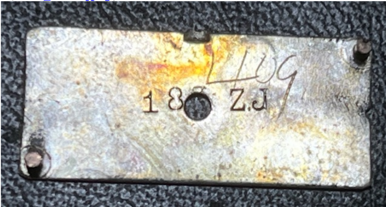
4) IMG_1819.jpeg , downloaded 159 times