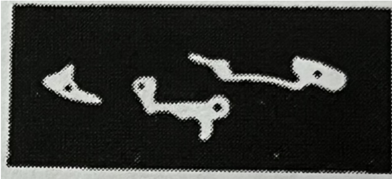
3) IMG_1818.jpeg , downloaded 157 times