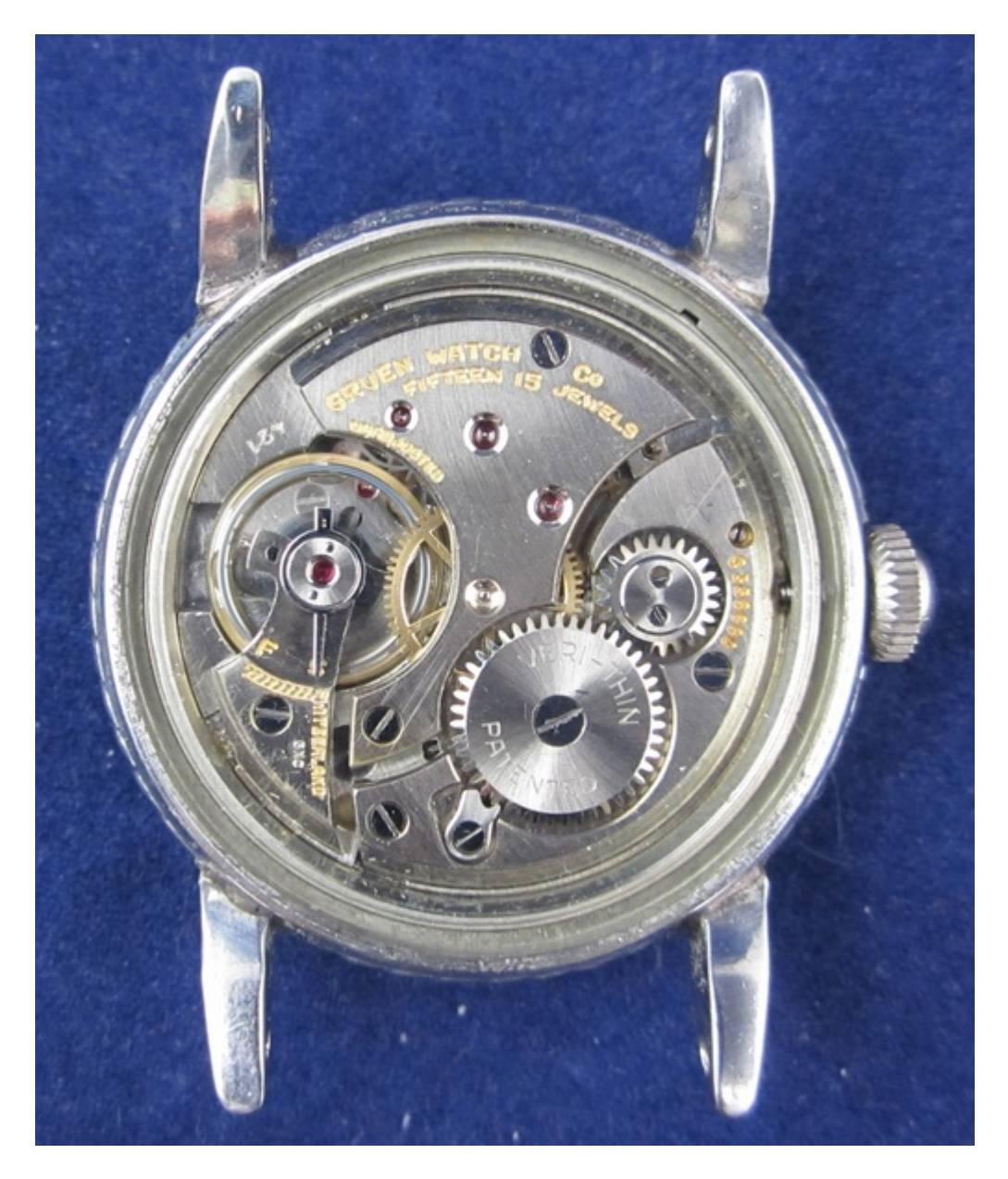
4) Veri-thin Submarine 04.JPG, downloaded 429 times