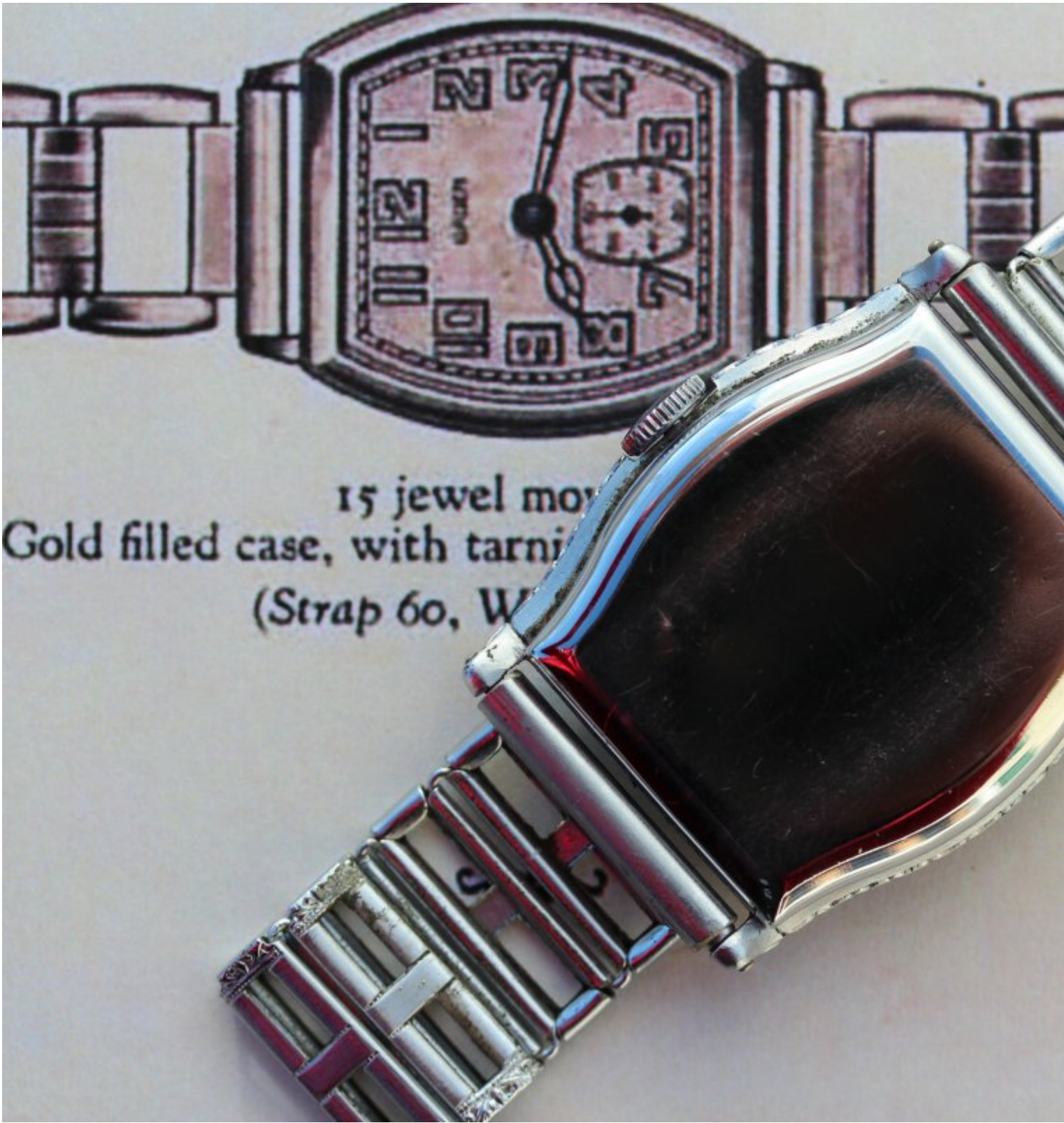
15 jewel movement Gold filled case, with tarnish (Strap 60, W)