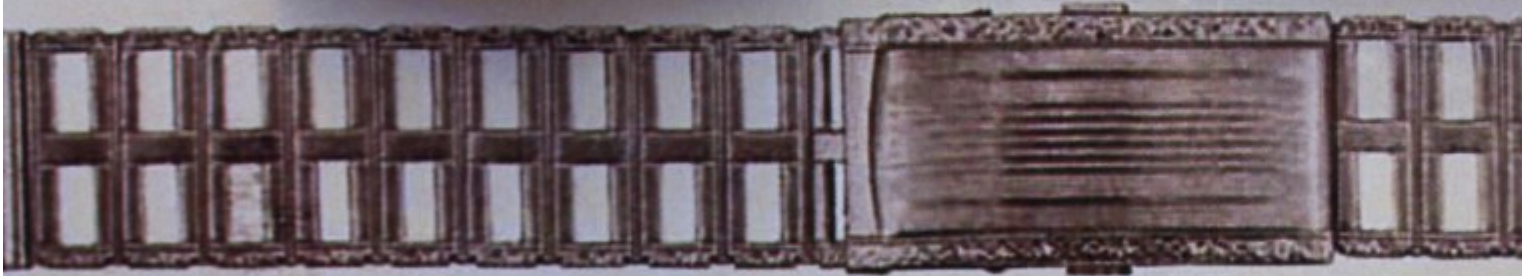
Flex No. 25—Tarnish-proof nickel band, 5-fold b