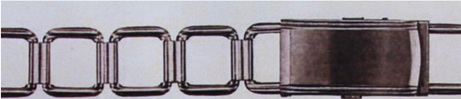
Flex No. 51—White, green or coin gold filled, 5-fold