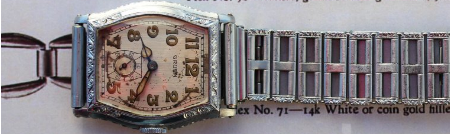
Flex No. 71—14k White or coin gold filled