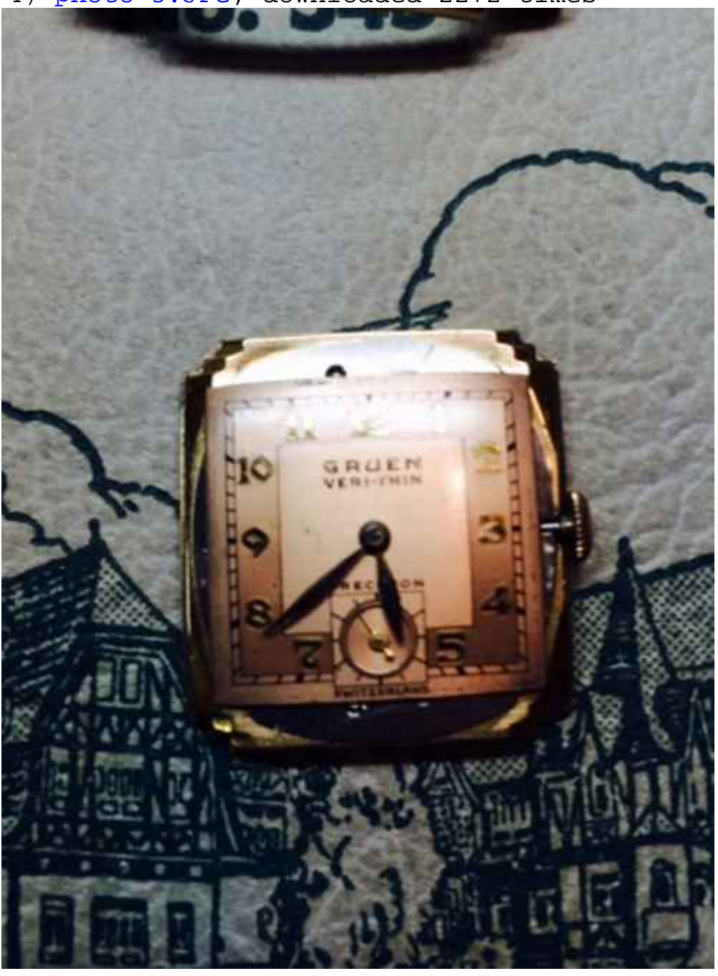
5) photo 4.JPG, downloaded 2220 times