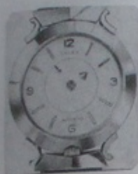
Green Strap 888 Calibre 55055 14KYG $200-250