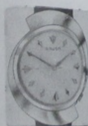
Green Strap 893 Calibre 42255 14KYG $250-300