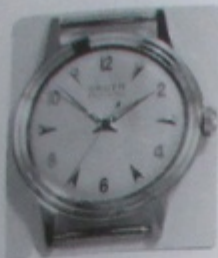
Green Strap 887 Calibre $10-20 Gold Filled $30-40 10KYG $80-85 14KYG $90-110