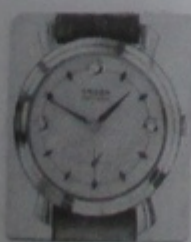
Green Strap 890 Calibre 415 Yellow Rolled Gold Plate $30-40 Yellow Gold $90-110