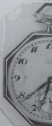
Gruen Ultra Thin 7 Calibre Ultra Thin 14KYG $150-200