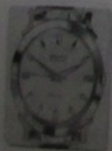
Green Strap 881 Calibre 55055 Yellow Gold Filled $40-60 Yellow Gold $100-110