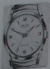
Green Strap 879 Calibre 52055 Yellow Rolled Gold Plate $30-40 Yellow Gold $90-110