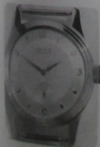
Green Strap 899 Calibre $10-20 Gold Filled $30-40 10KYG $70-80 14KYG $80-100