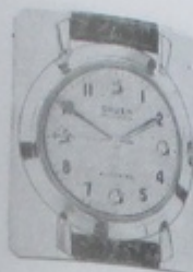
Green Strap 892 Calibre 55055 Yellow Rolled Gold Plate $50-60 Yellow Gold $100-125