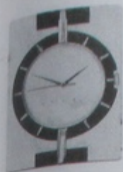
Green Strap 895 Calibre 21555 Yellow Gold Filled $50-75