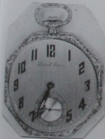
Gruen Ultra Thin 9 Calibre Ultra Thin 14KYG $300-350 18KYG $350-400