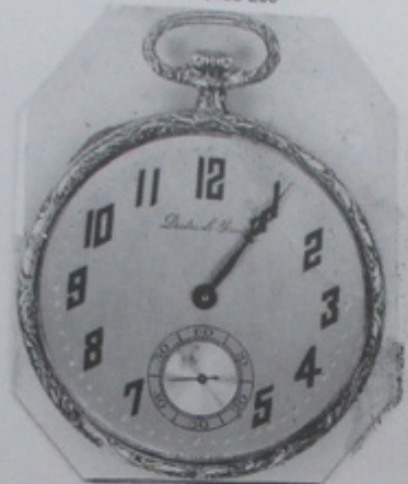
Gruen Ultra Thin 6 Calibre Ultra Thin 18KYG $450-500 18KWG $450-500