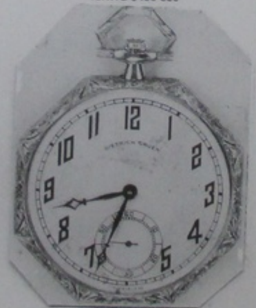
Gruen Ultra Thin 10 Calibre Ultra Thin 18KYG $350-400 18KWG $350-400