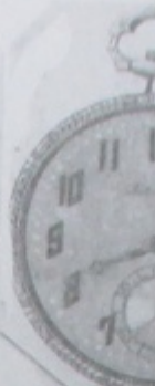
Gruen Ultra Thin 3 Calibre Ultra Thin 14KYG $150-200