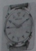
Green Strap 884 Calibre 42255 14KYG $90-110