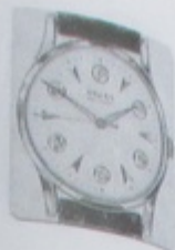
Green Strap 891 Calibre 42255 Yellow Rolled Gold Plate $30-40 Yellow Gold $90-110