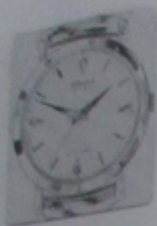
Green Strap 882 Calibre 52005 Yellow Rolled Gold Plate $30-40 Yellow Gold $85-110