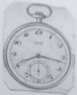
Gruen Ultra Thin 2 Calibre Ultra Thin 14KYG $150-200