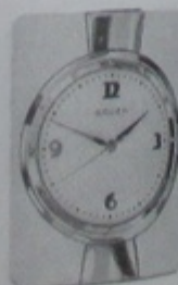
Green Strap 894 Calibre 42255 14KYG $90-110