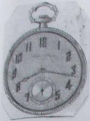
Gruen Ultra Thin 1 Calibre Ultra Thin 14KYG $350-400