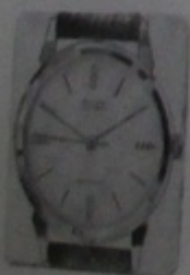
Green Strap 886 Calibre 55055 14KYG $90-110