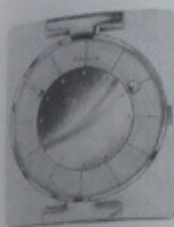
Green Strap 896 Calibre 515 14KYG $150-175