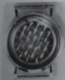
Green Strap 889 Calibre $10-20 Gold Filled $30-40 10KYG $80-85 14KYG $90-110