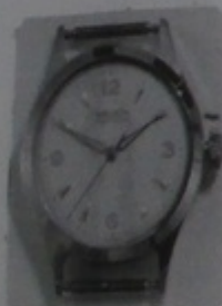
Green Strap 885 Calibre 55055 Calibre $10-20