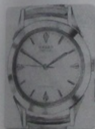
Green Strap 897 Calibre 55055 10KYG $80-90 14KYG $90-100