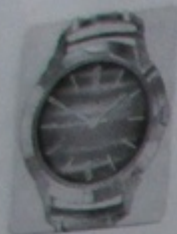
Green Strap 878 Calibre 525-25 Gold Filled $30-40 10KYG $80-85 14KYG $90-110