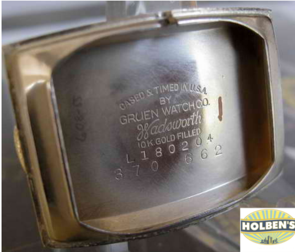
4) Gruen Curvex Evans -from the book The 1950s page 165.jpg , downloaded 1820 times