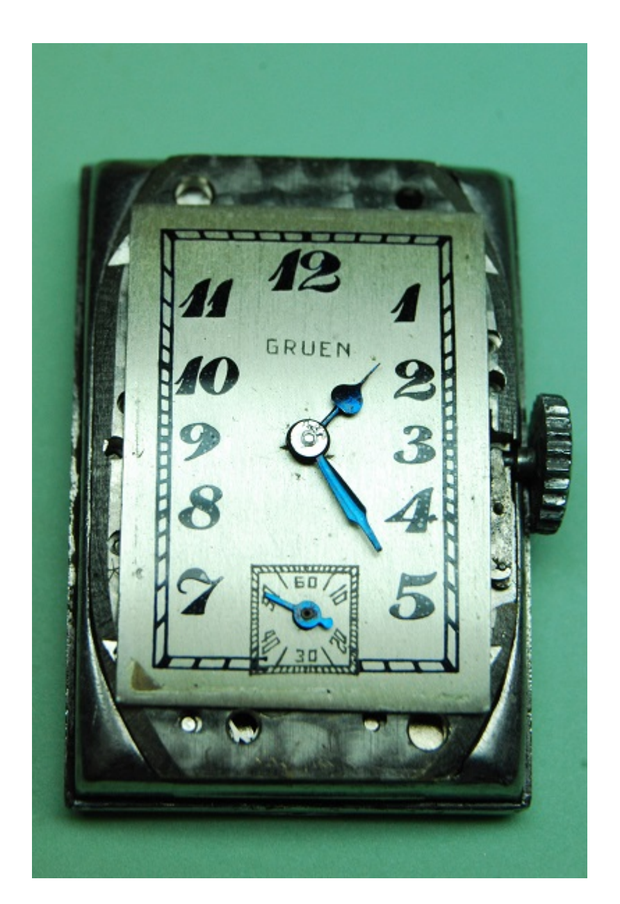
4) front.jpg, downloaded 1762 times