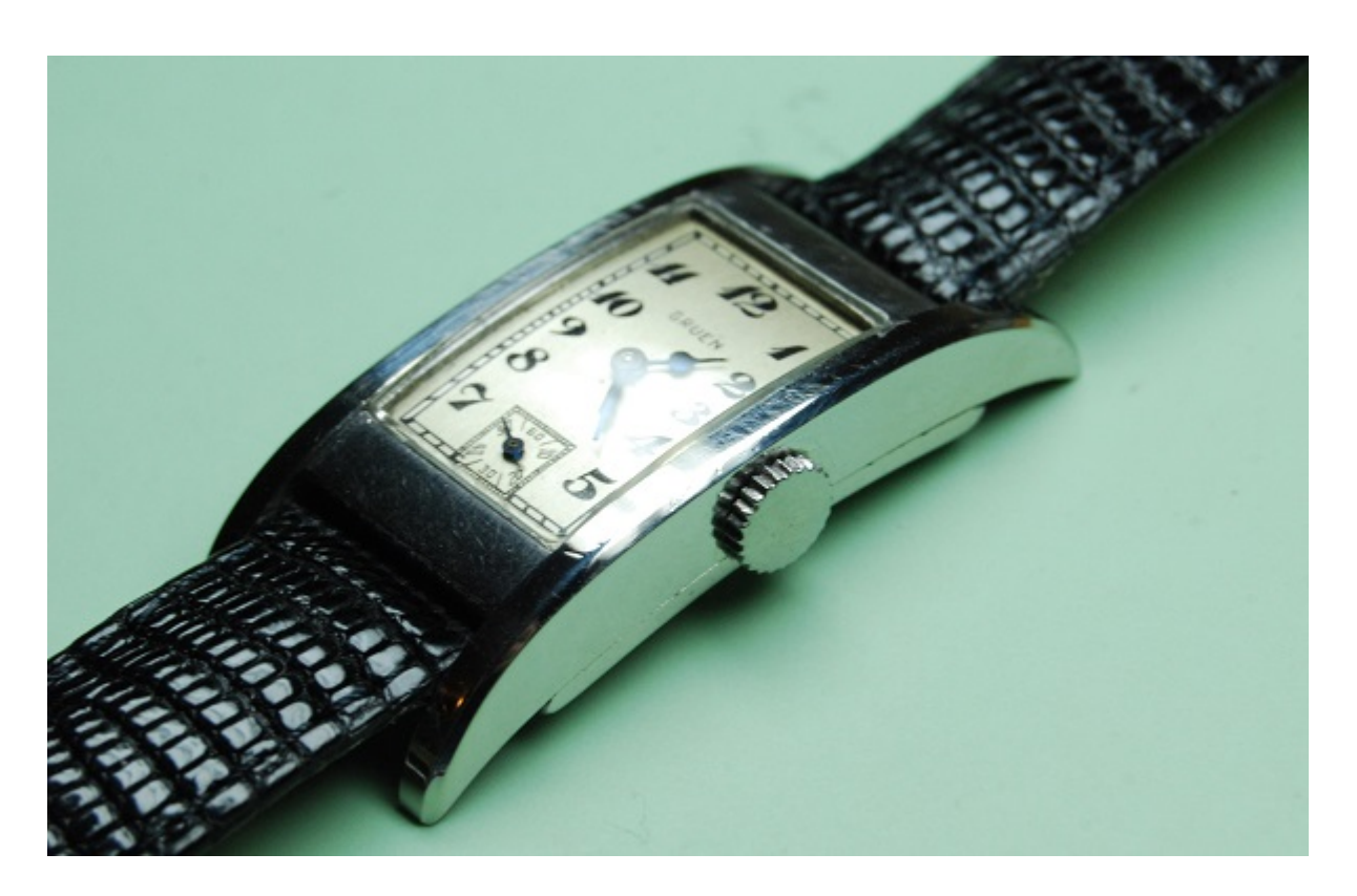
5) movement.jpg, downloaded 1691 times