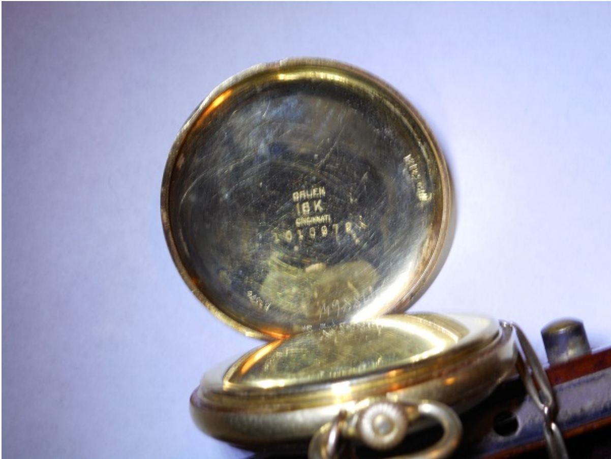
5) DSCN0159.JPG , downloaded 3274 times