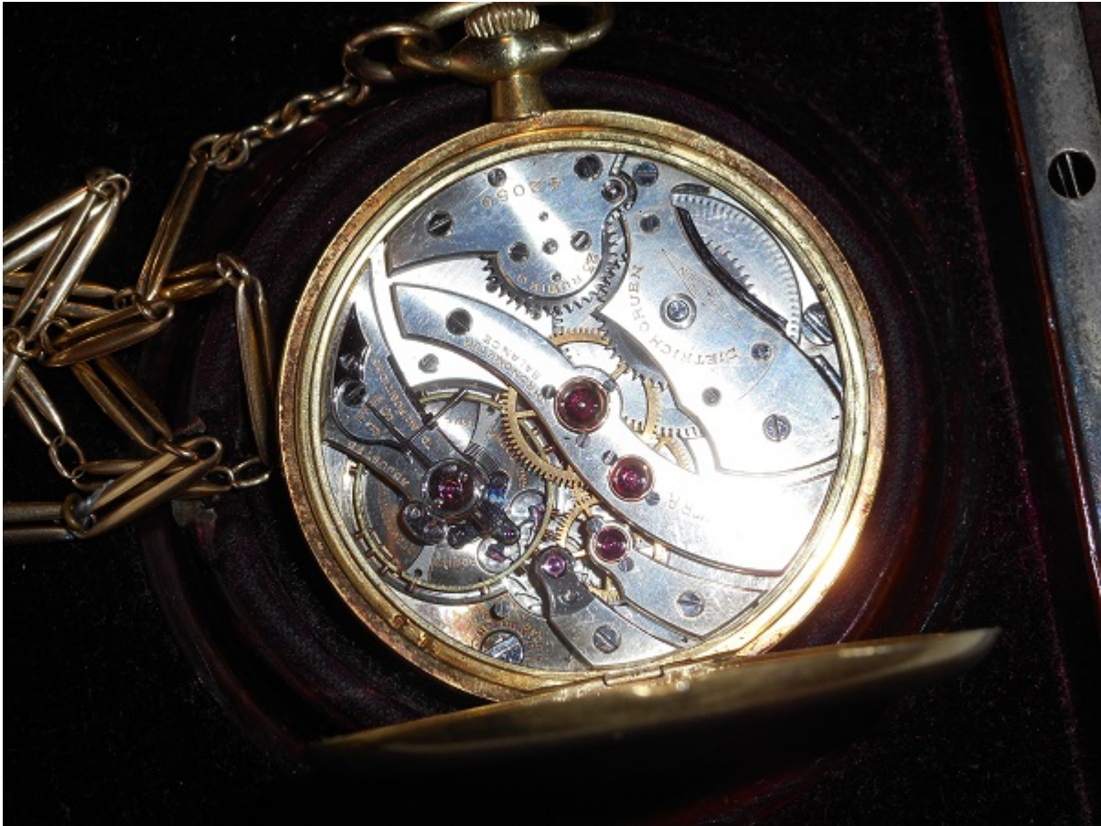
8) DSCN0162.JPG , downloaded 3274 times