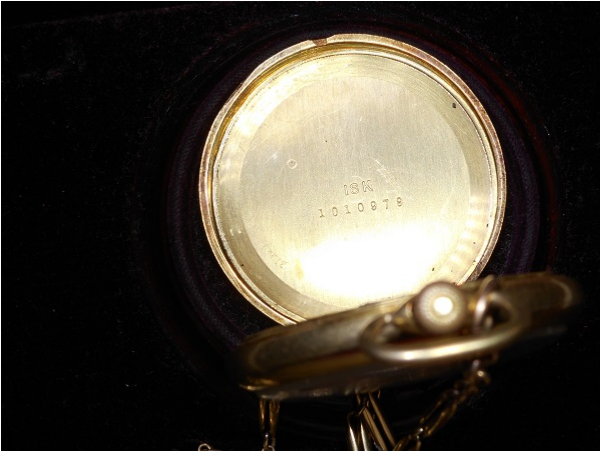
6) DSCN0160.JPG , downloaded 1378 times