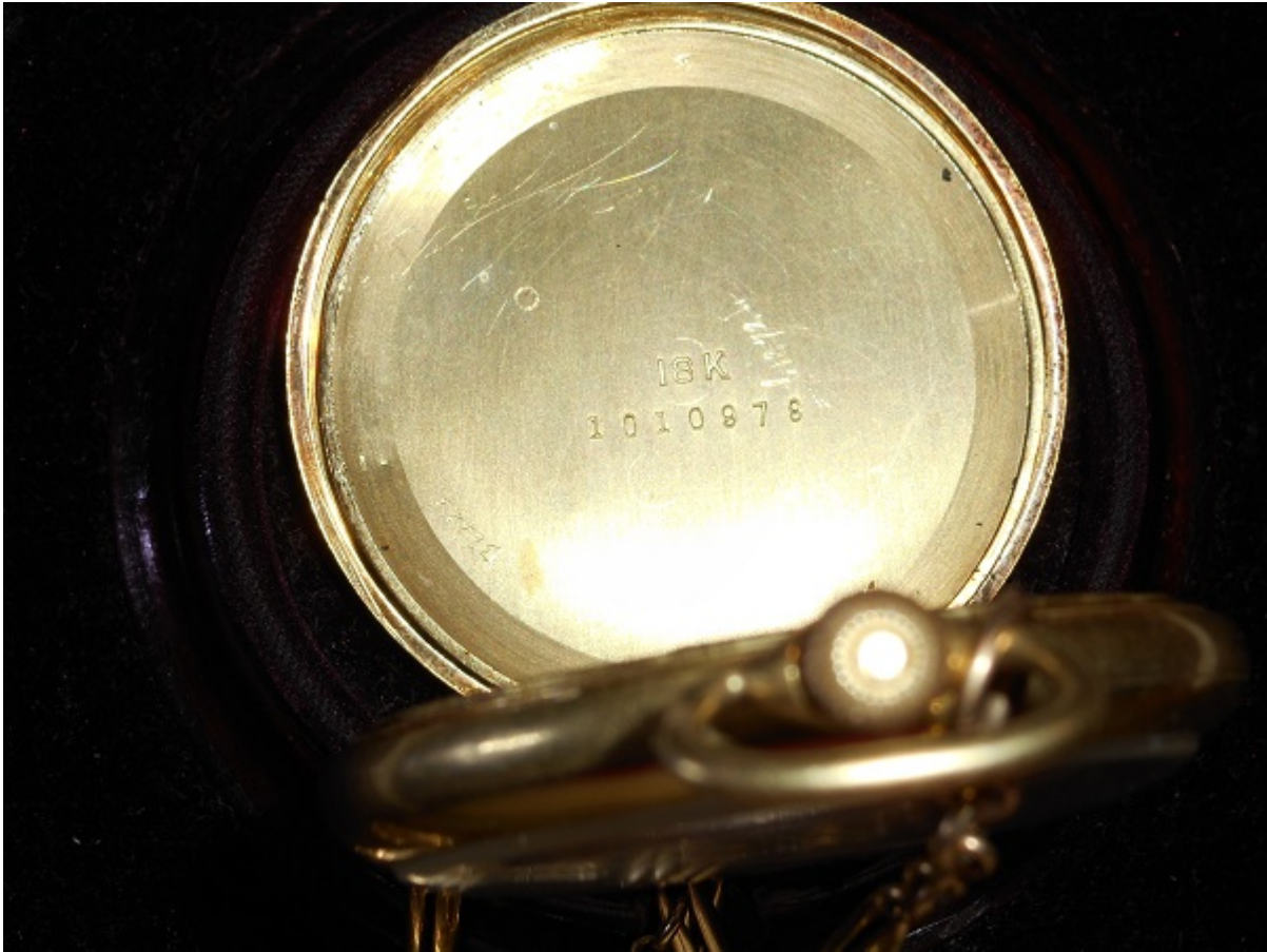
7) DSCN0161.JPG , downloaded 1366 times