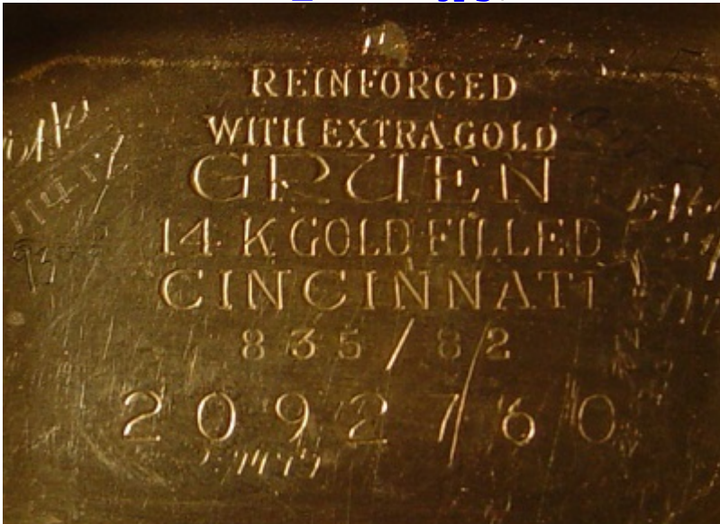
3) Movement_small.jpg , downloaded 1736 times