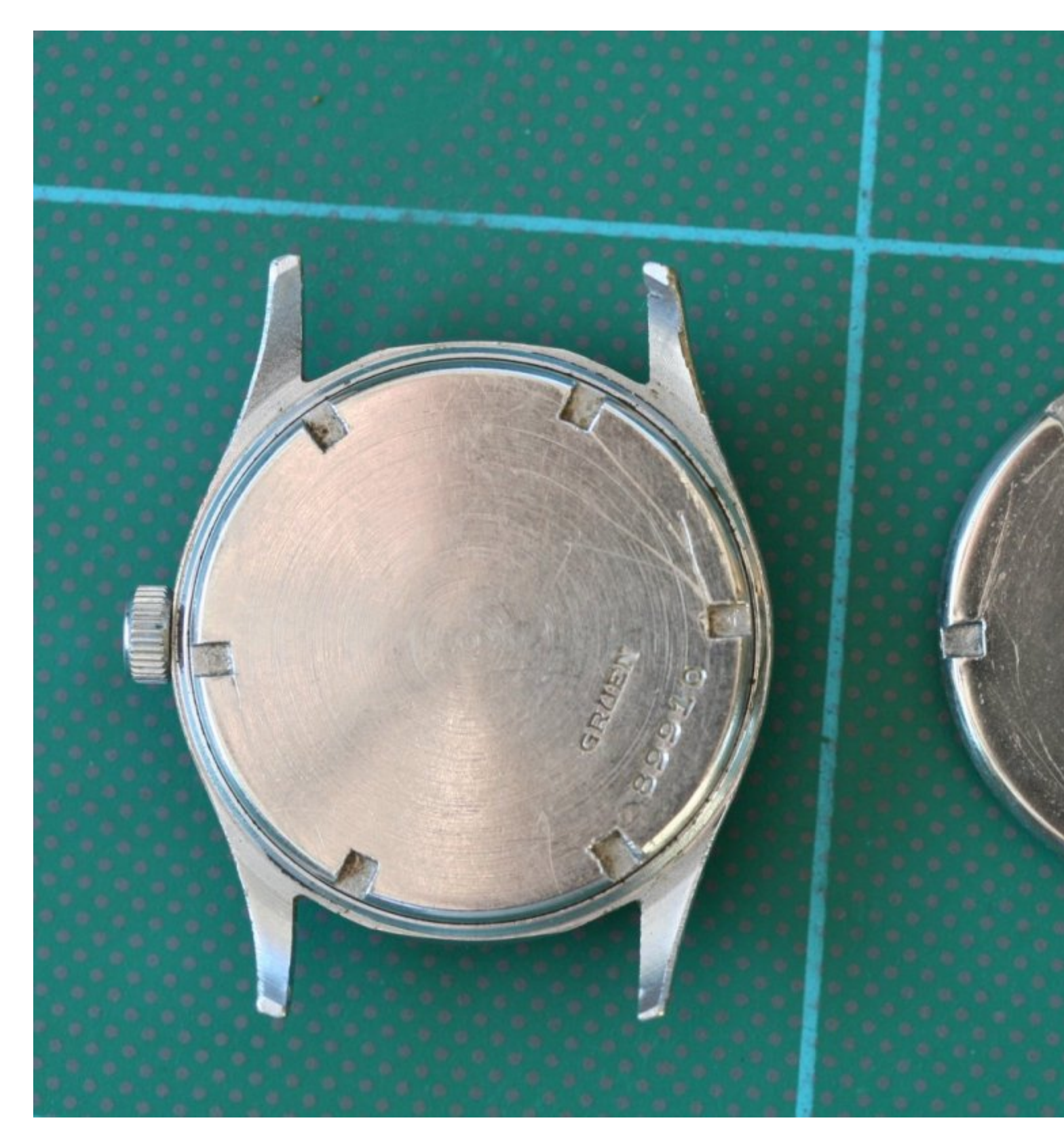
2) Img_3723b.jpg, downloaded 2658 times