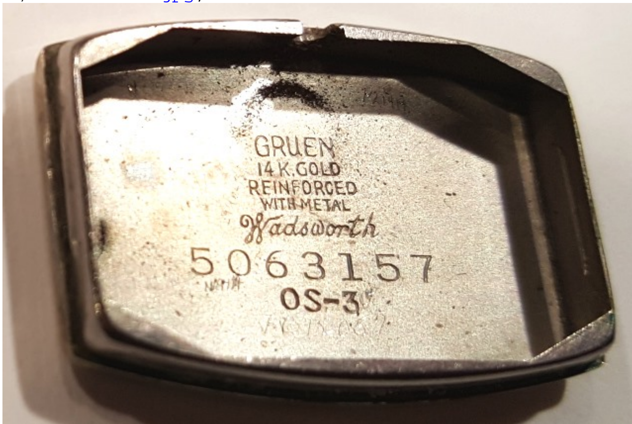
5) Movement.jpg , downloaded 2169 times