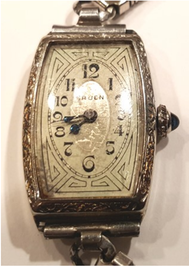
2) CaseSide.jpg , downloaded 1961 times