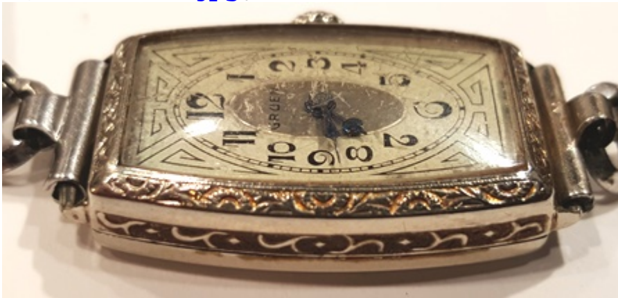
3) Dial.jpg , downloaded 1983 times