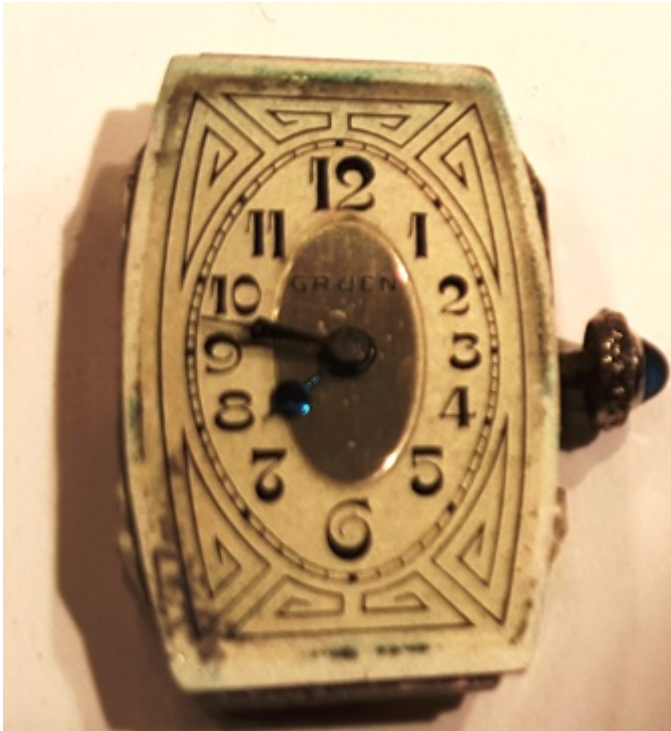
4) InsideCase.jpg , downloaded 1966 times