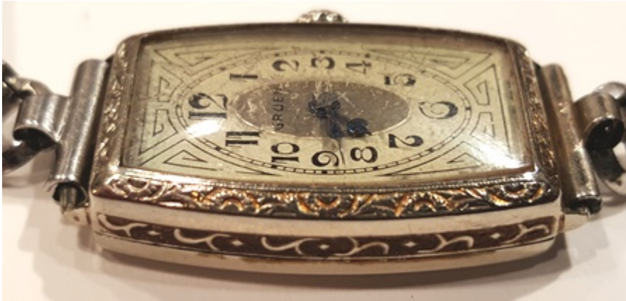
3) Dial.jpg , downloaded 251 times