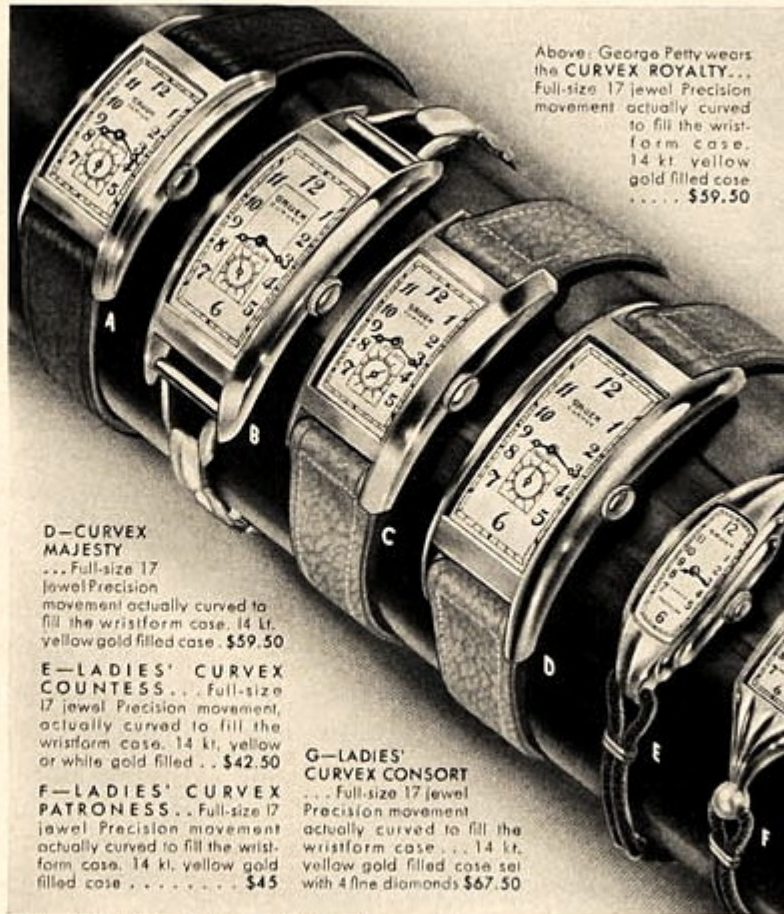
Above: George Petty wears the CURVEX ROYALTY... Full-size 17 jewel Precision movement actually curved to fill the wristform case. 14 kt. yellow gold filled case... $59.50

THE GRUEN WATCH COMPANY • TIME HILL CINCINNATI • U. S. A. • In Canada: Toronto, Ontario