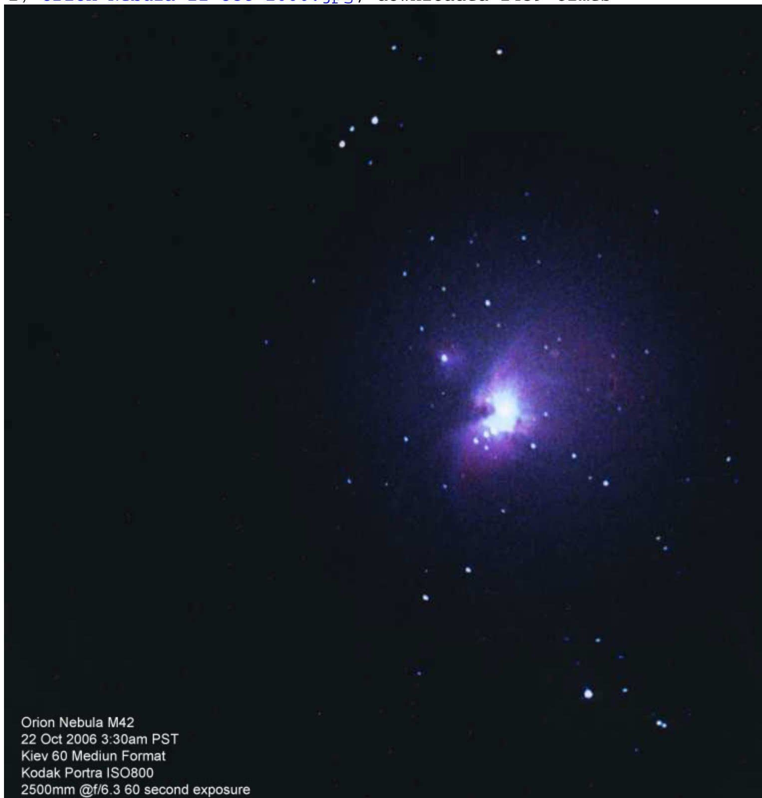
Orion Nebula M42 22 Oct 2006 3:30am PST Kiev 60 Mediun Format Kodak Portra ISO800 2500mm @f/6.3 60 second exposure

2) Orion Nebula 22 Oct 2006.jpg , downloaded 2439 times