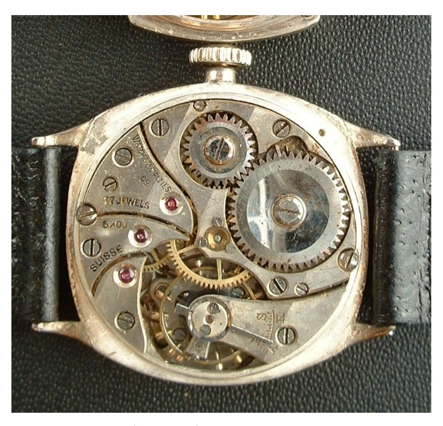
2) 1923 Country Life - Paris+Square F63.JPG, downloaded 1118 times