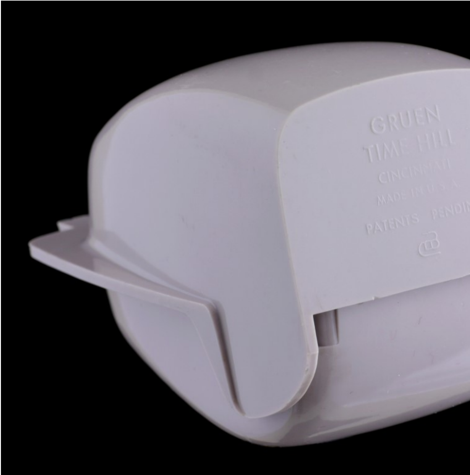
5) The Ohio daily-express_13Oct1950_Curvex-Box_Detail_1366.jpg , downloaded 1179 times