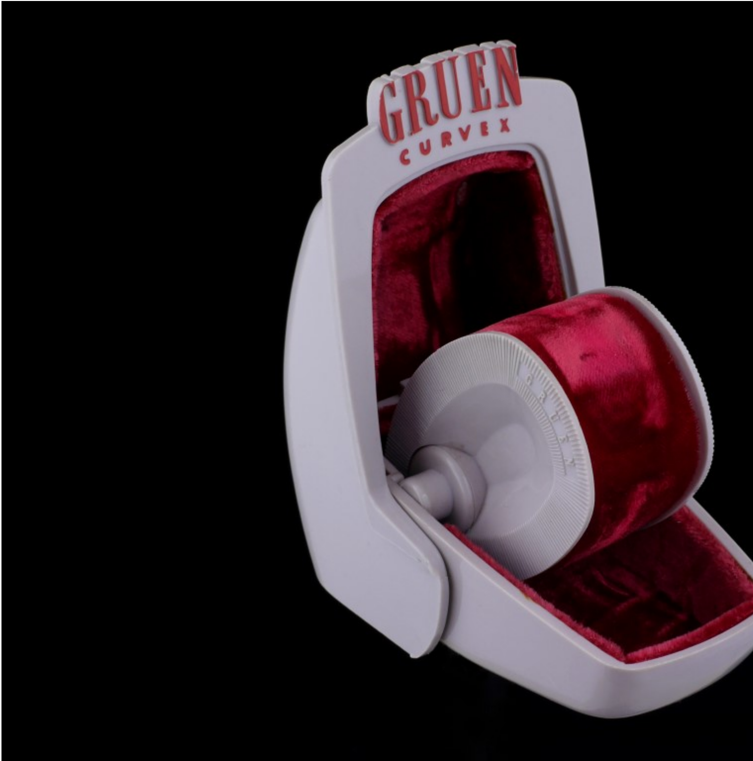
4) Gruen-Curvex-Box_egg_0066_1366.jpg , downloaded 2584 times