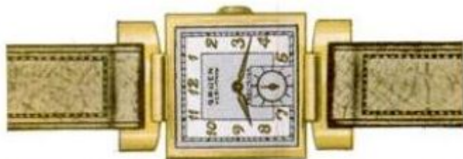
VERI-THIN ZEPHYR—17 jewel Precision movement, pink or yellow gold-filled case.....$42.50

1) zephyrlifemag10.1.40.JPG , downloaded 1142 times