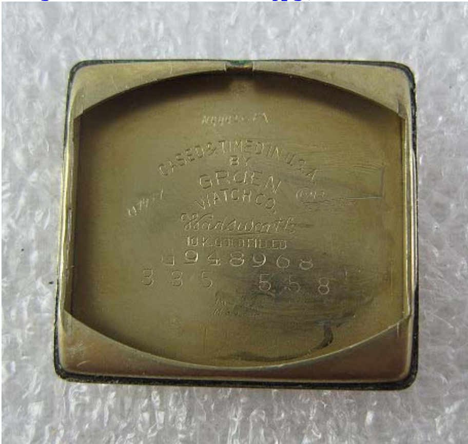
3) gruen5401movt.jpg , downloaded 816 times