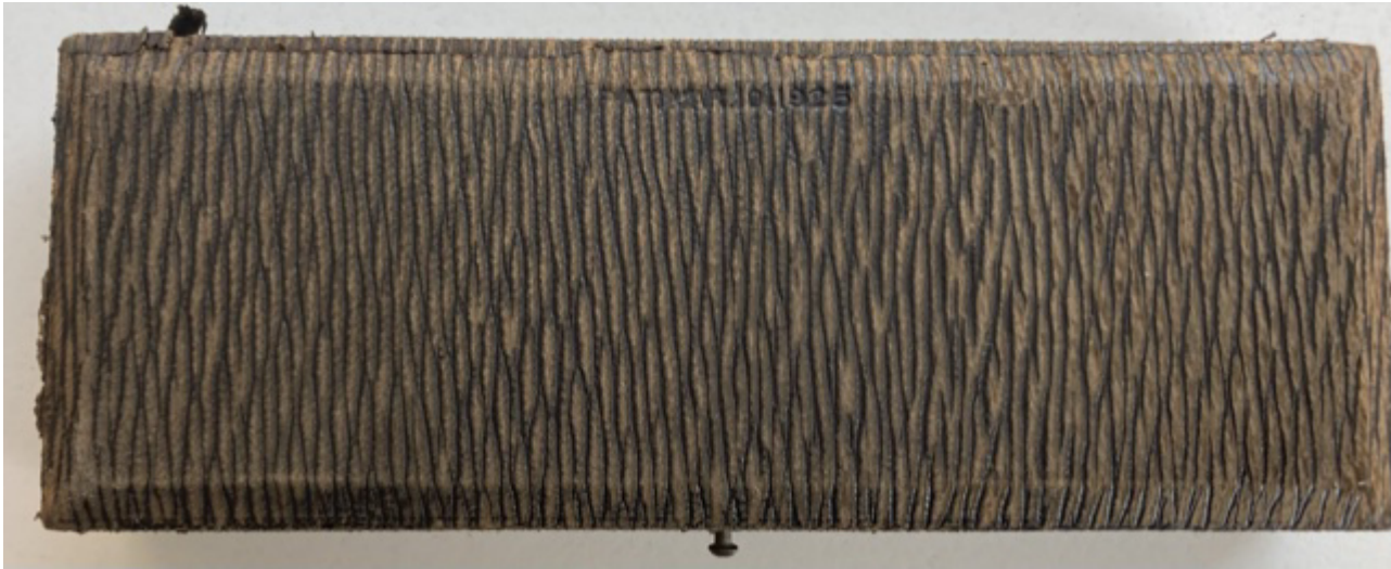
3) 6C8A30D3-1287-4589-8B99-A4A7D0392D9B.jpeg , downloaded 994 times