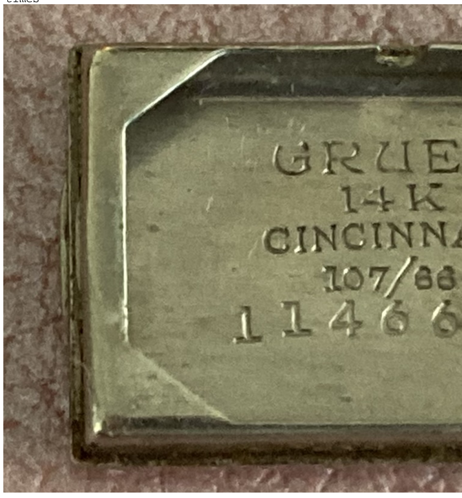
3) 510B4E18-EA08-47BE-B775-48B5DE9B0D39.jpeg, downloaded 1927 times