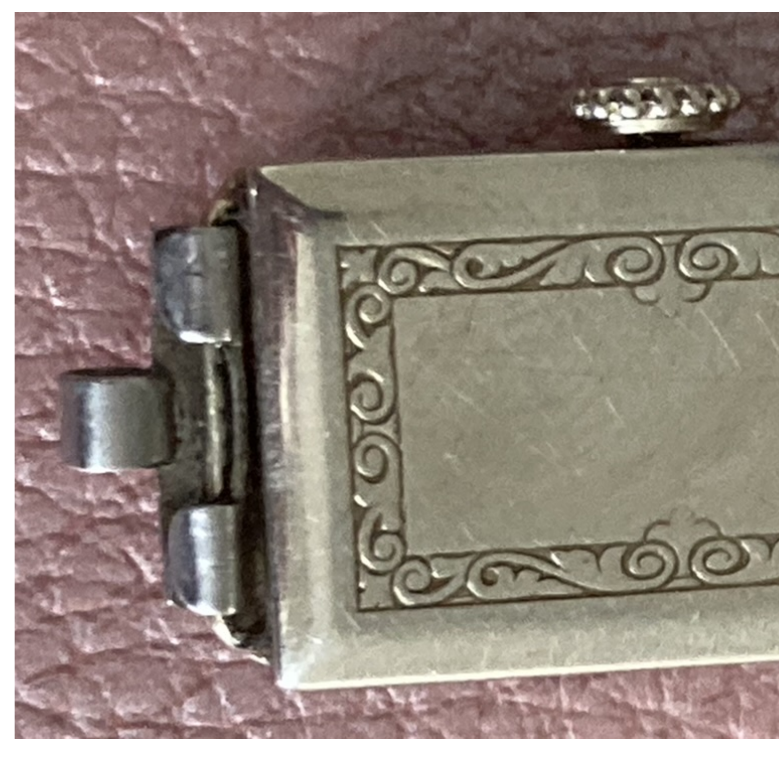
4) E45D6330-F2E2-4D97-A5F9-5CC5ABBF89BC.jpeg, downloaded 1914 times