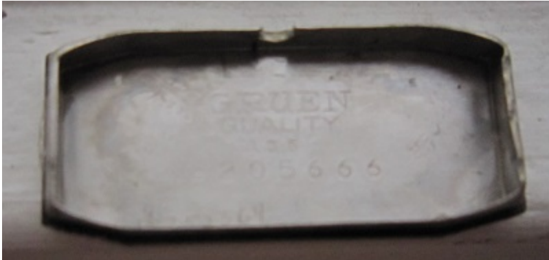
3) Bag 505_movement.jpg , downloaded 1290 times