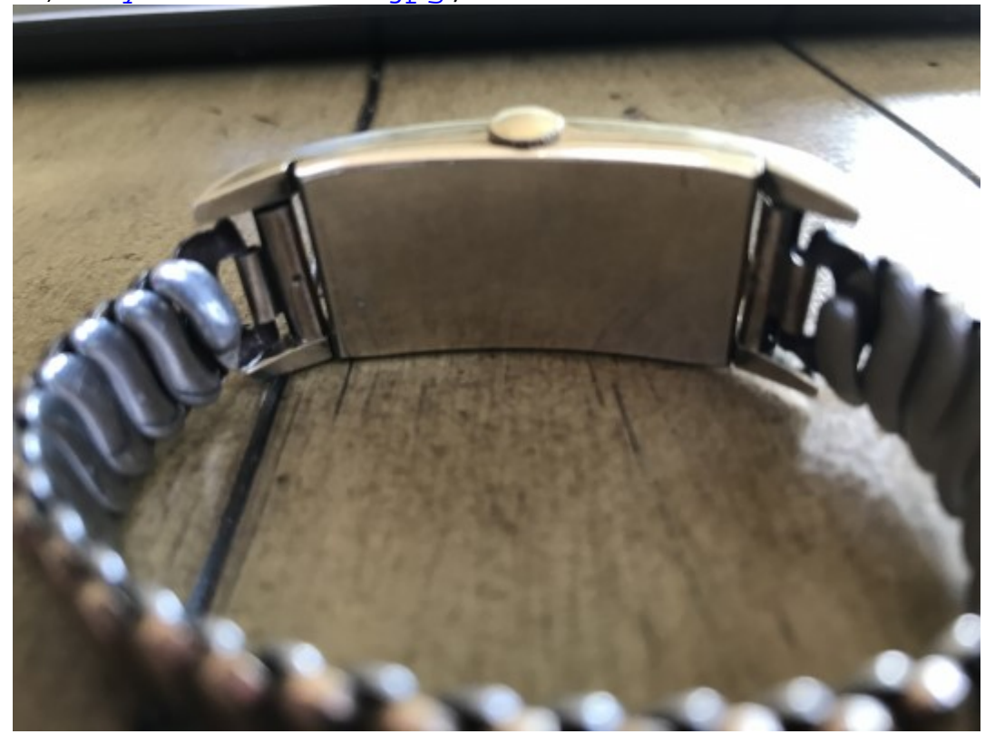
4) Royal 4 resize.jpg, downloaded 866 times

3) Royal 3 resize.jpg, downloaded 852 times