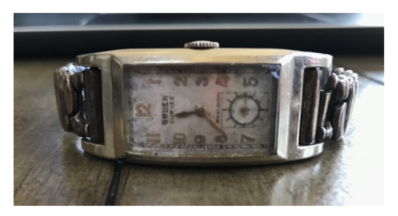
5) Royal 5 resize.jpg, downloaded 847 times

Page 4 of 13 ---- Generated from Vintage Gruen