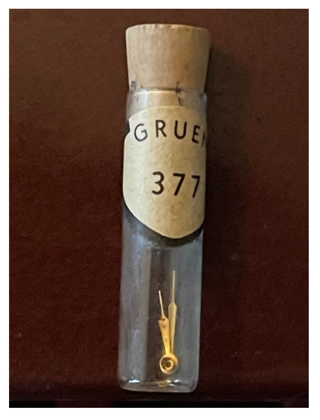
3) Gruen assortment (3).jpg, downloaded 1738 times

Page 7 of 19 ---- Generated from Vintage Gruen