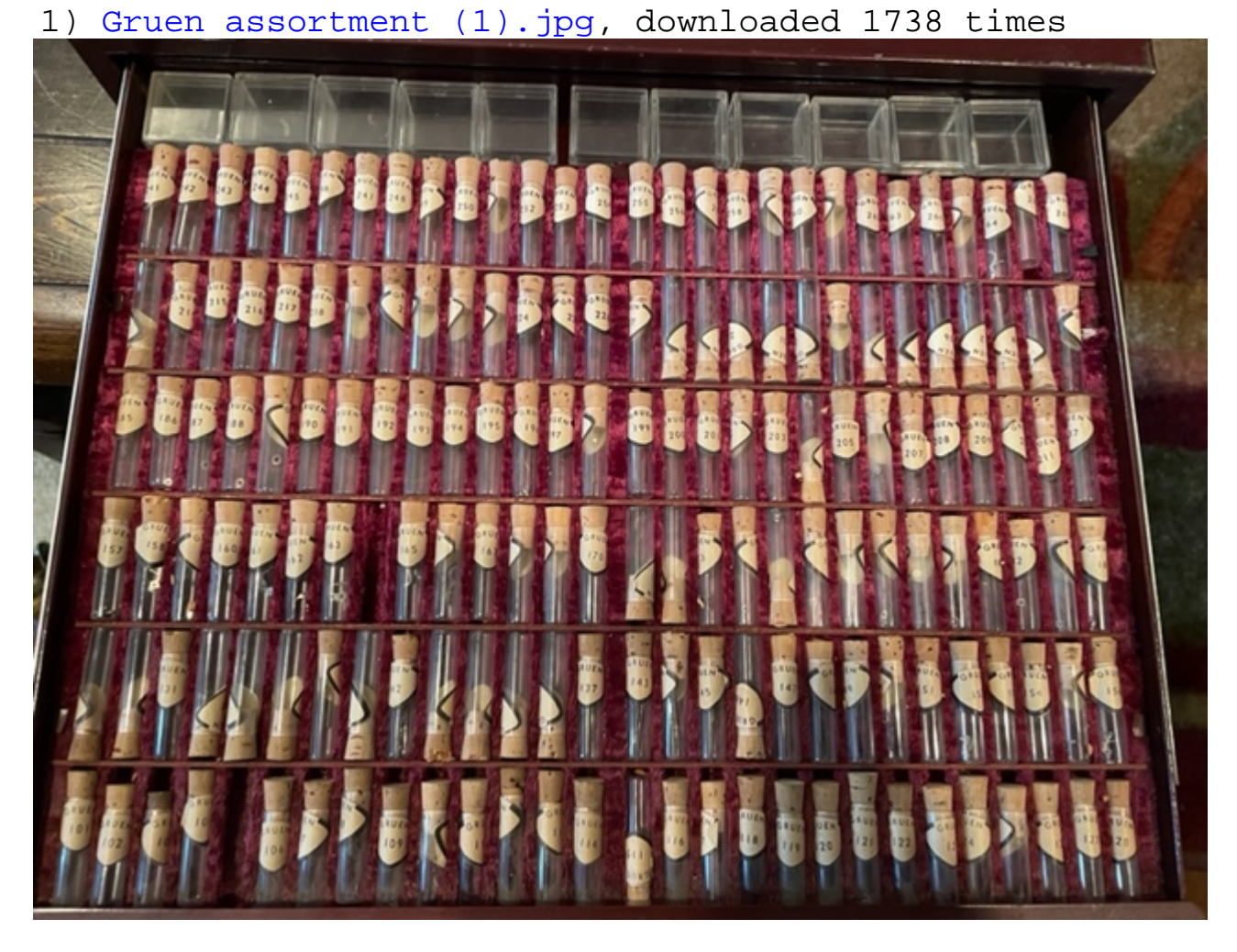
2) Gruen assortment (2).jpg, downloaded 1745 times

Page 6 of 19 ---- Generated from Vintage Gruen