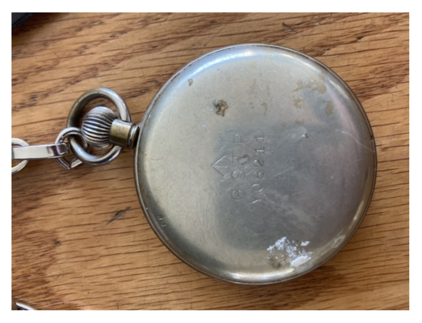
3) 21BEE673-5D35-45CE-ABD3-7219E200B46B.jpeg, downloaded 1545 times