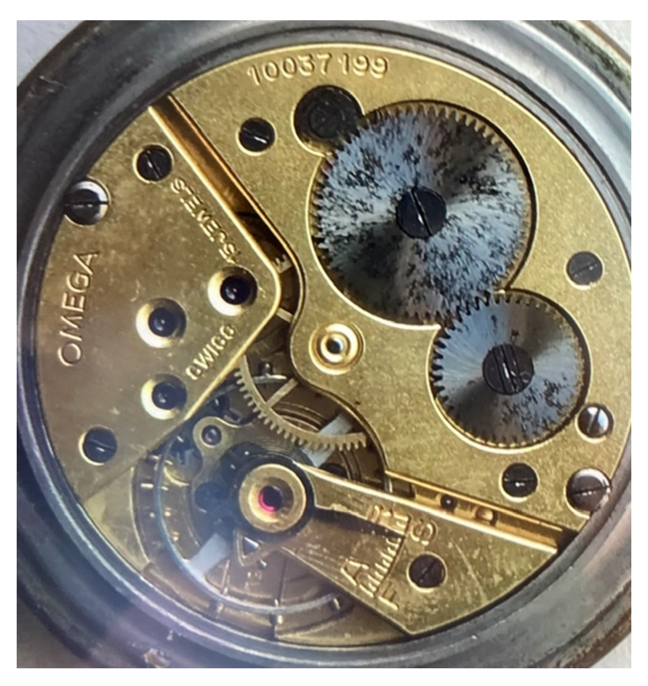
4) 529F8C5B-8D63-47D1-ACCB-727E4FAE7874.jpeg, downloaded 1547 times