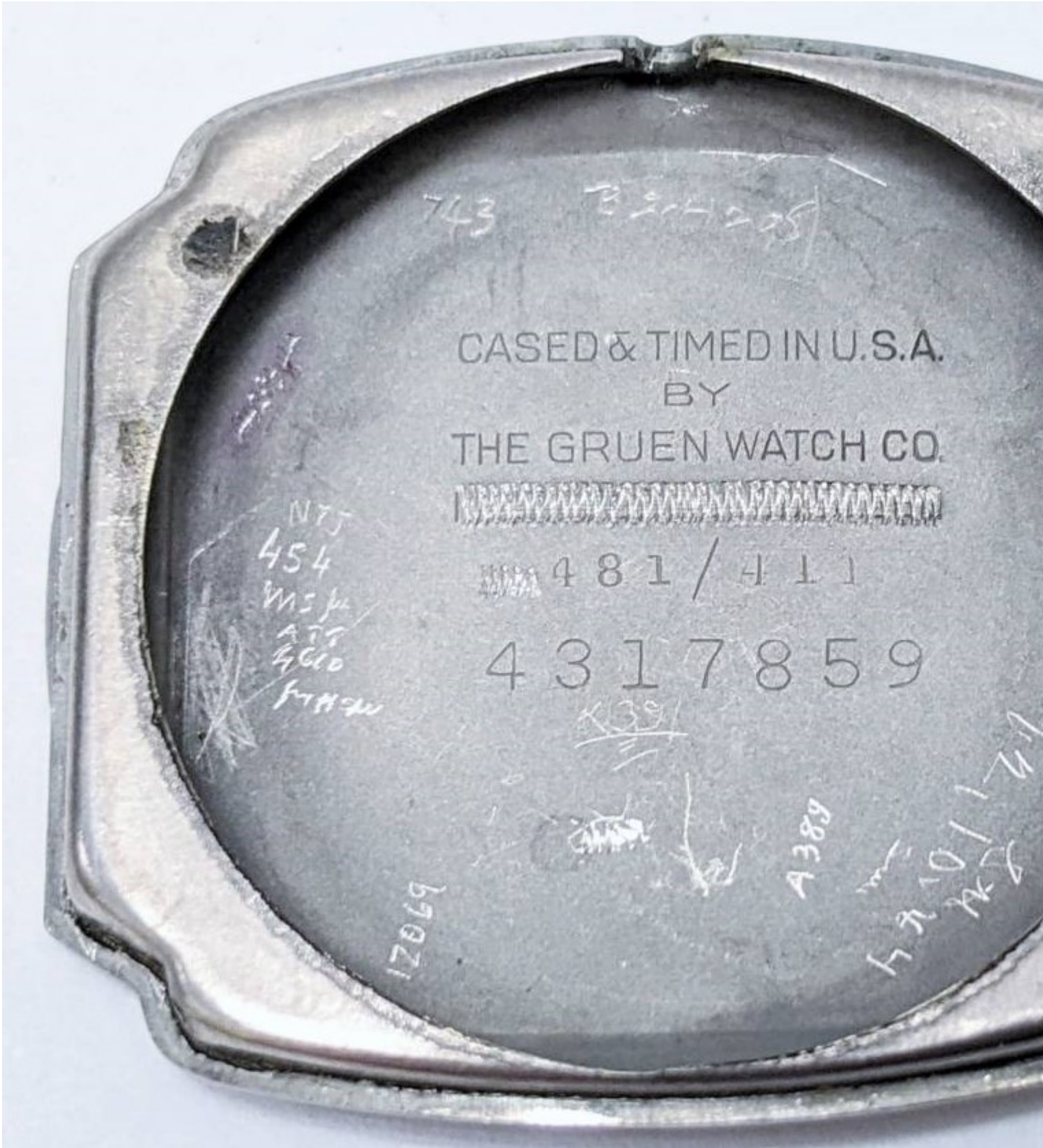
4) o1050207487_6.jpg , downloaded 1109 times