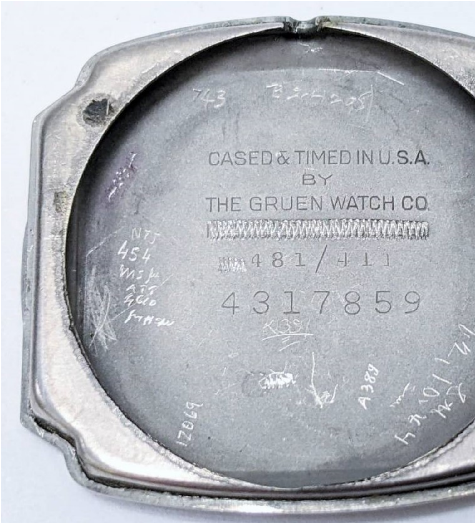
4) o1050207487_6.jpg , downloaded 1436 times