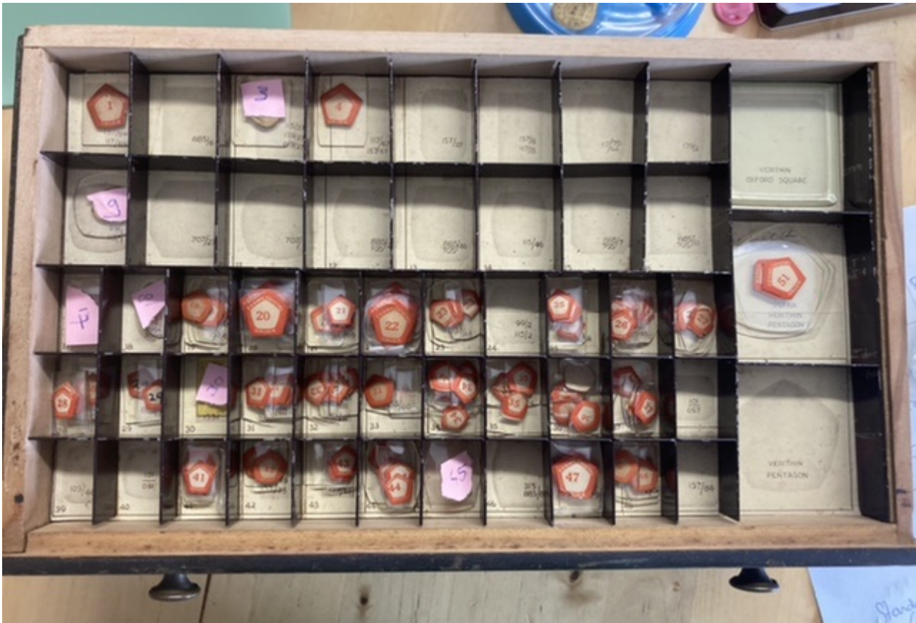
3) C5ED93DC-40BF-4D97-B145-46DFAAA563AC.jpeg , downloaded 1107 times