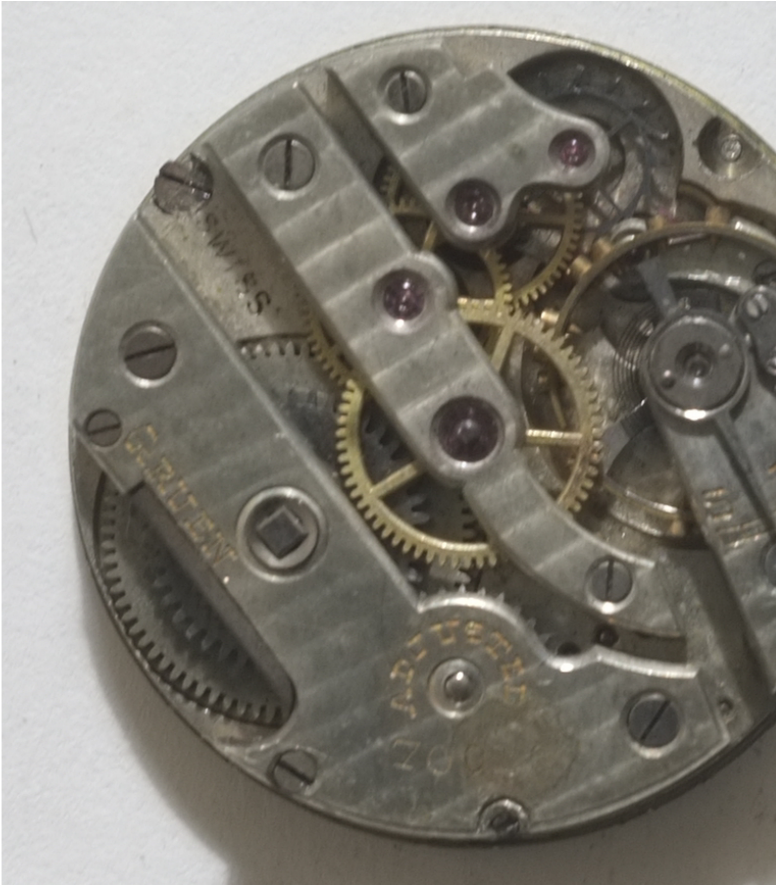
2) unknown caliber.jpg , downloaded 2877 times