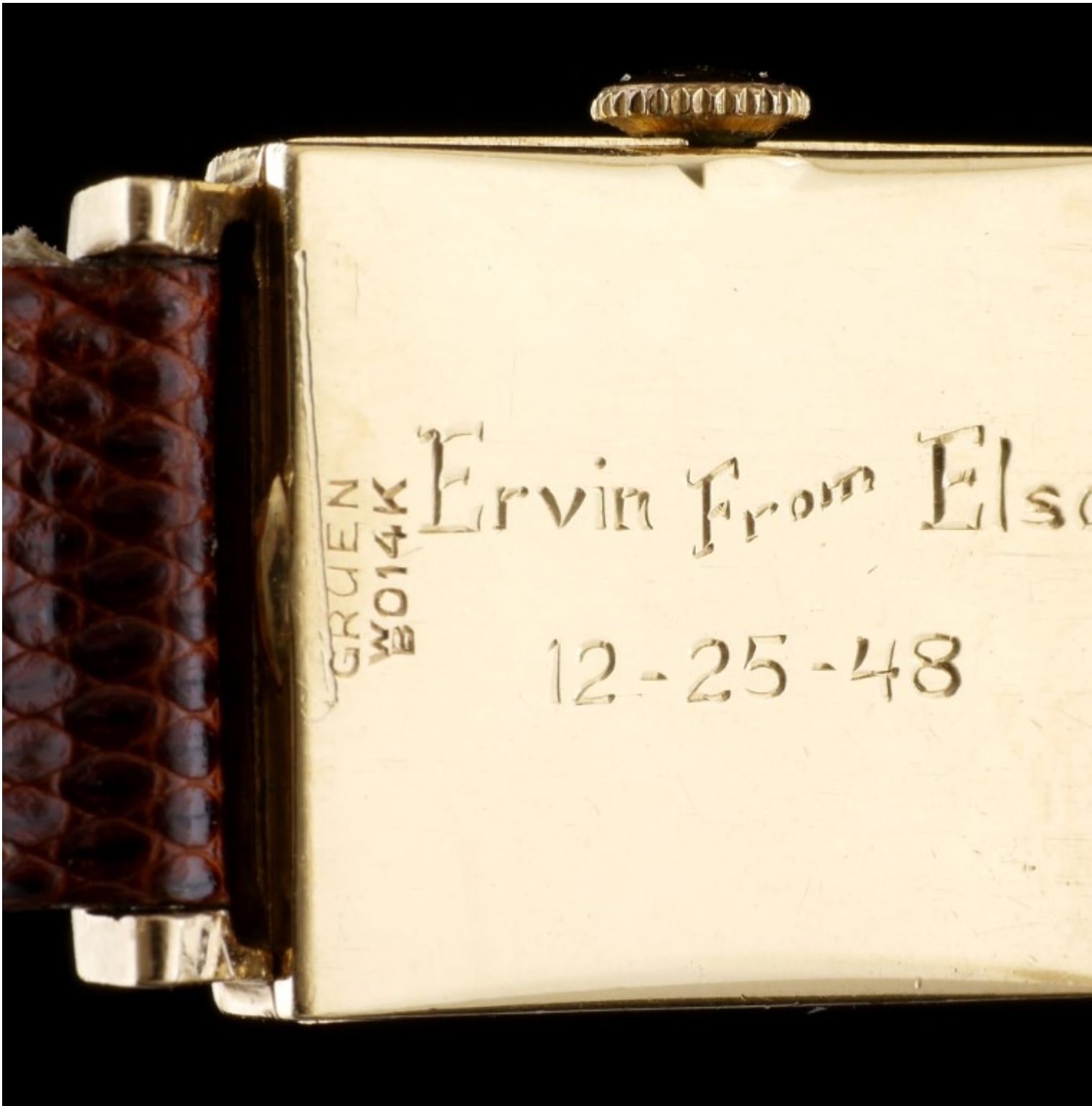
6) Gruen-Curvex_440-584_14K_10_1366.jpg , downloaded 3236 times