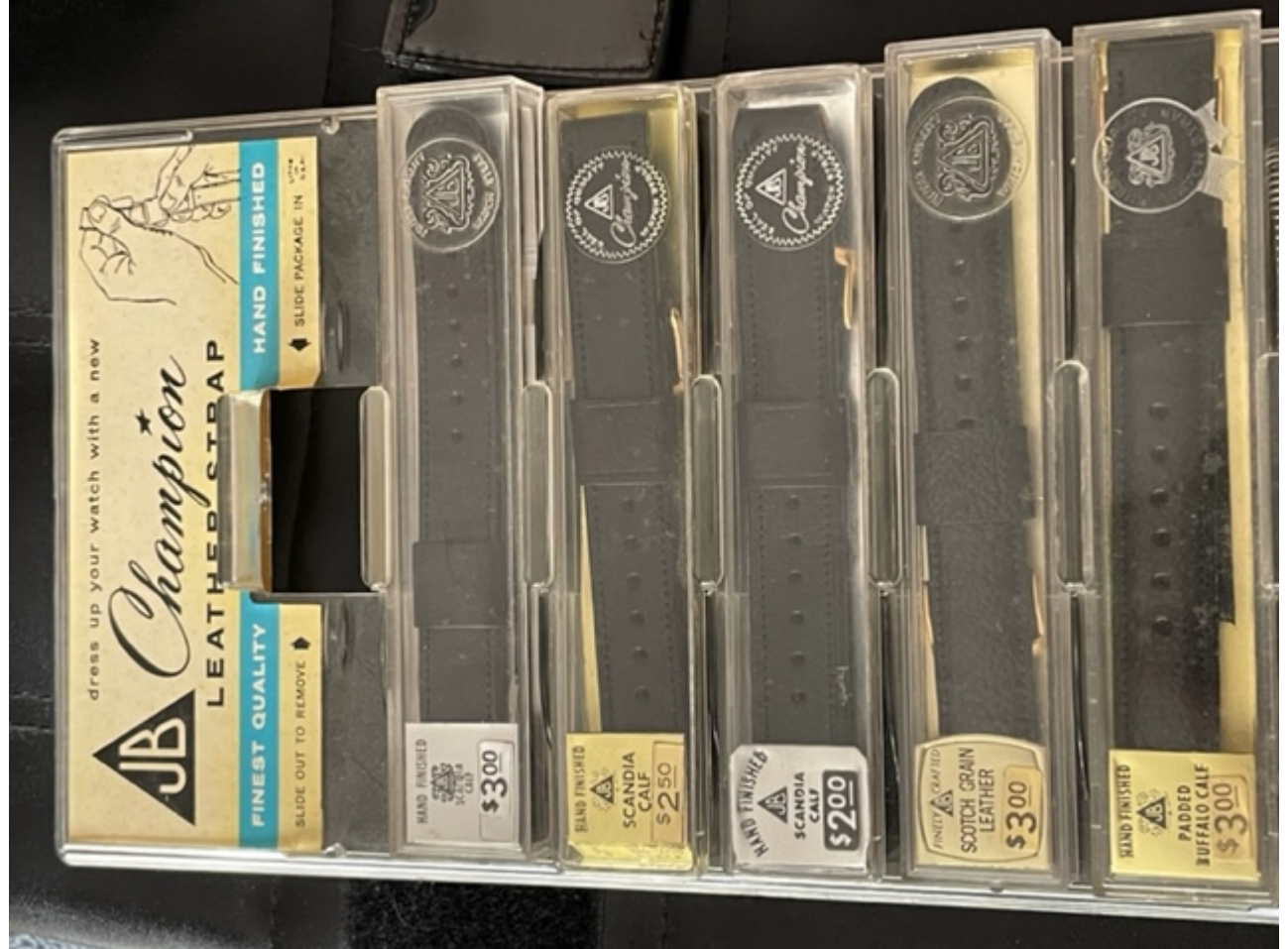
2) IMG_4995.jpg, downloaded 1745 times

Page 3 of 11 ---- Generated from Vintage Gruen