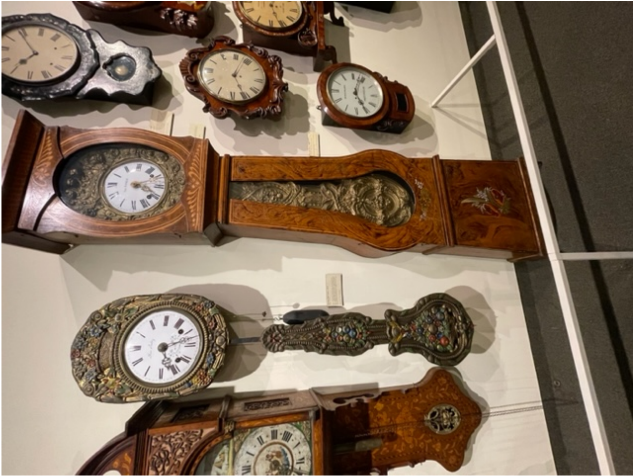
4) IMG_6031.jpg , downloaded 1259 times