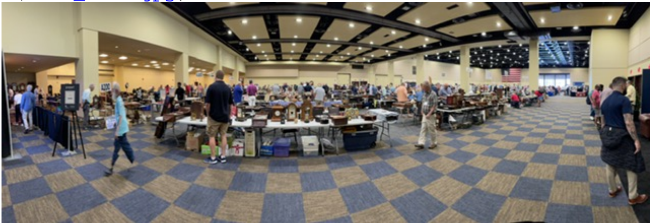
5) IMG_6048.jpg , downloaded 1264 times