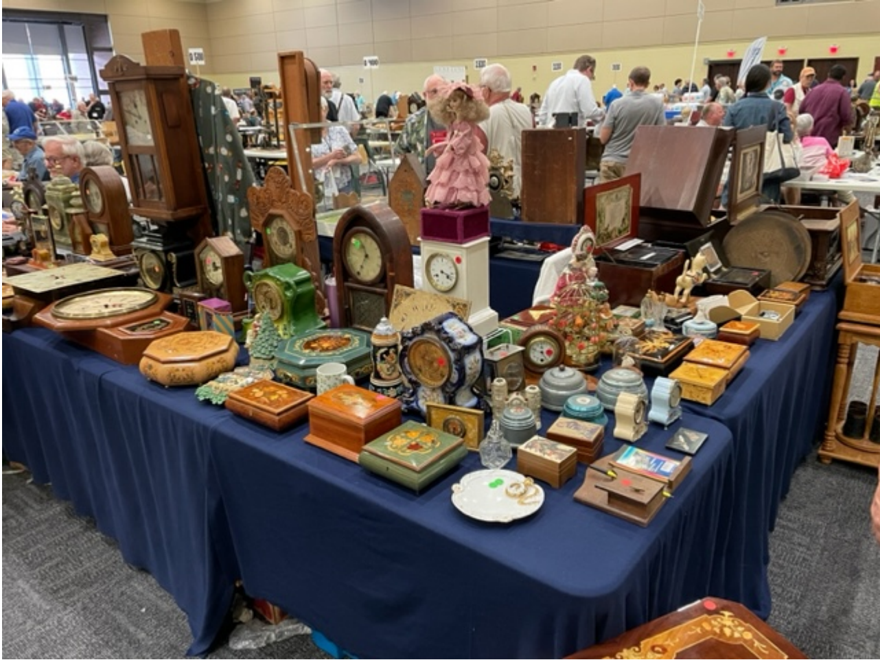
4) IMG_6044.jpg , downloaded 281 times