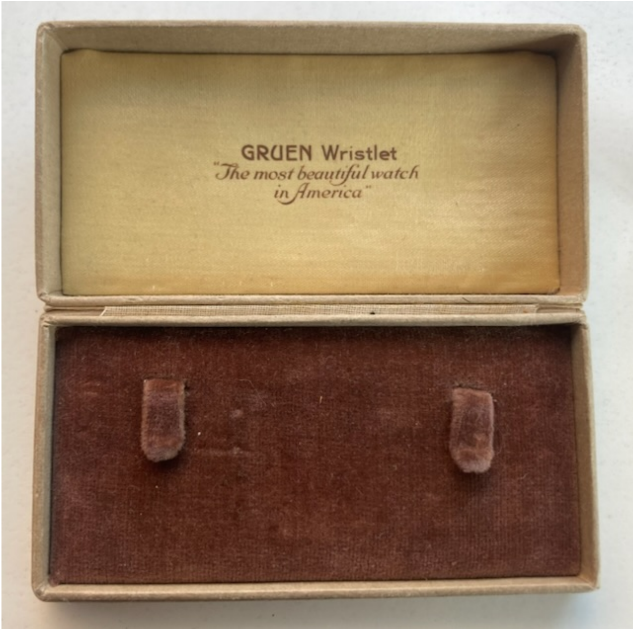
5) 417B8A04-FF65-426E-B0D6-33A2942A3D9E.jpeg , downloaded 752 times