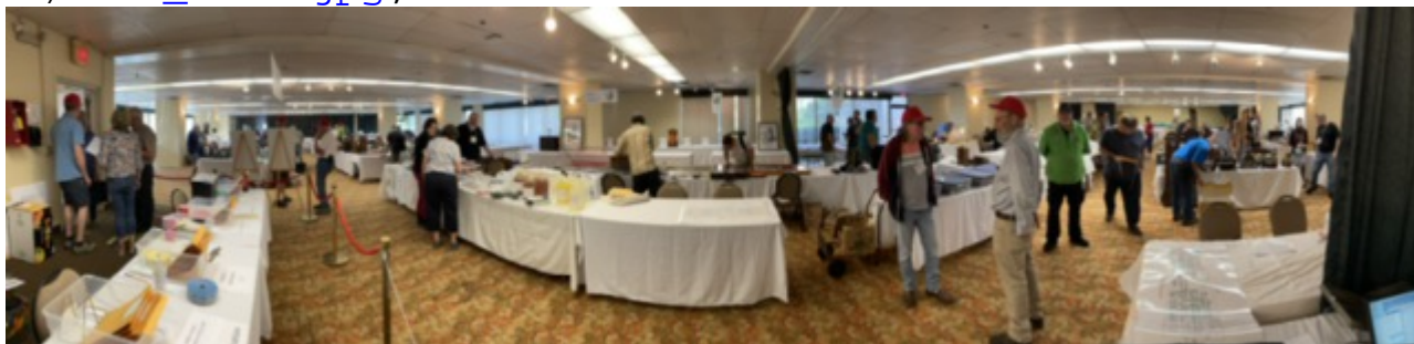
4) IMG_5848.jpg , downloaded 1567 times