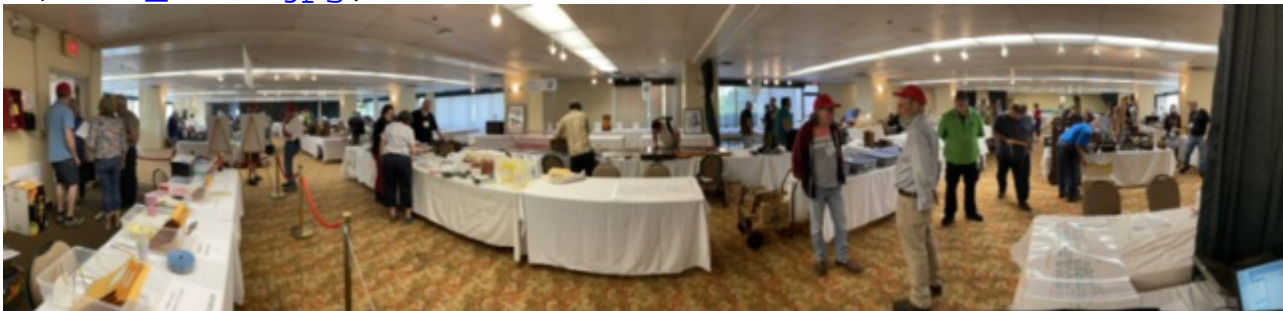
4) IMG_5848.jpg , downloaded 706 times