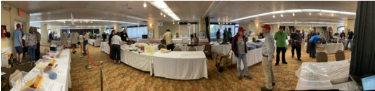
4) IMG_5848.jpg , downloaded 2322 times