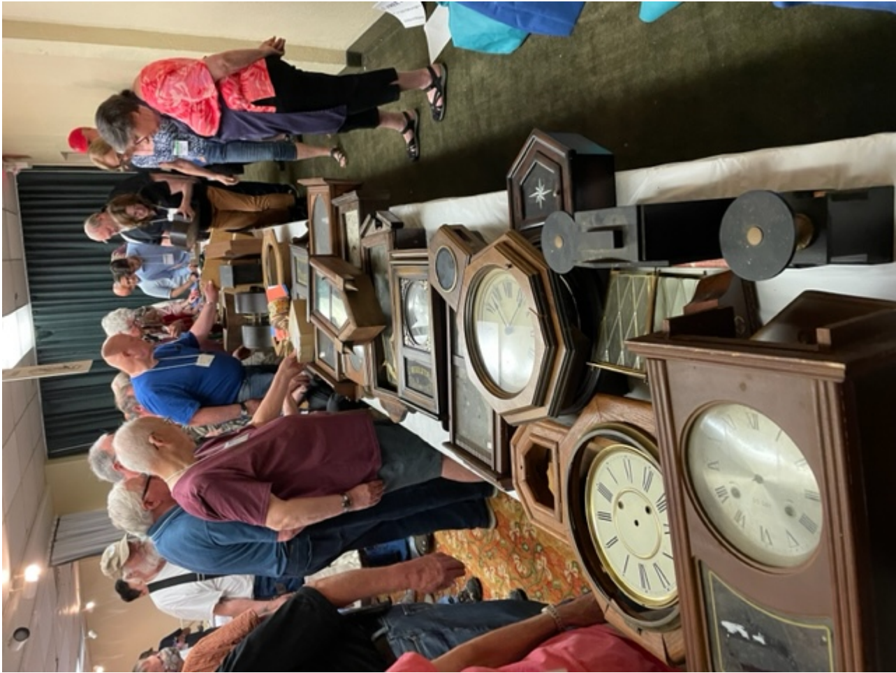
3) IMG_5847.jpg , downloaded 726 times