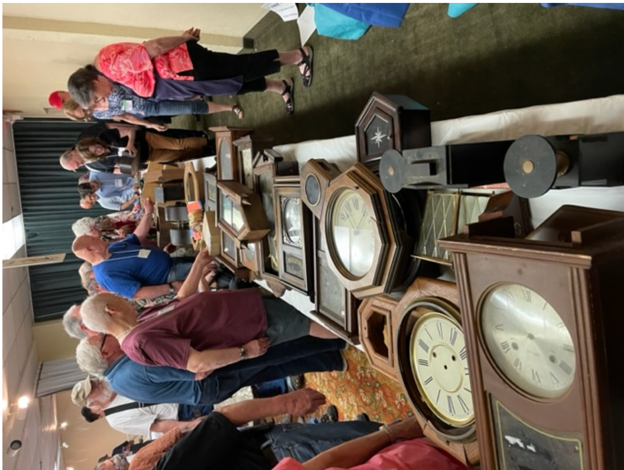
3) IMG_5847.jpg , downloaded 1594 times