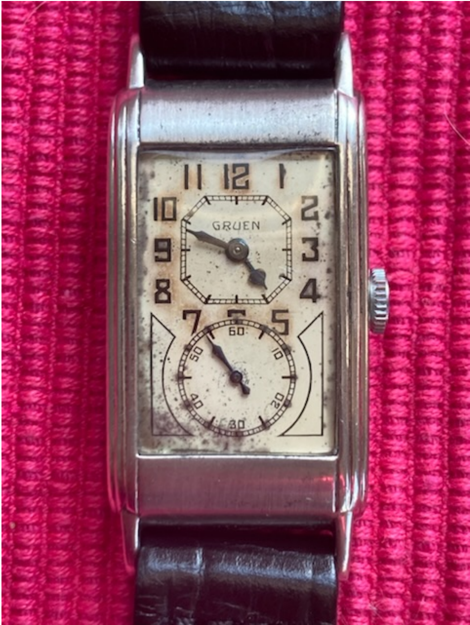
5) 9F2DA441-F910-4913-90B2-8B70C48B4822.jpeg , downloaded 2711 times