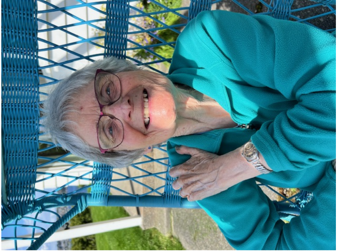
1) IMG_3975.jpg, downloaded 366 times

Subject: Re: The VeriThin Dix Posted by afire on Tue, 13 May 2025 17:30:05 GMT View Forum Message <> Reply to Message