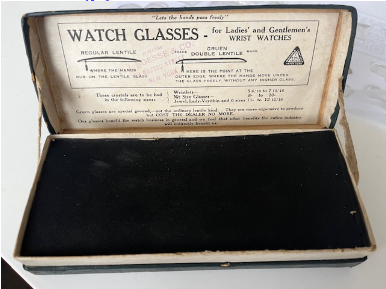
4) IMG_0946.jpeg , downloaded 260 times